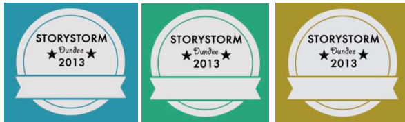
Figure 3: Dundee Storystorm Badges