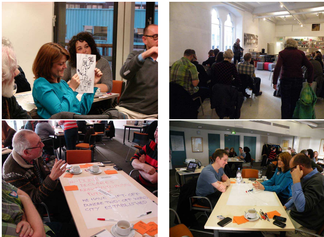
Figure 2: Storystorm Dundee workshop activities

Storystorm Dundee took was designed to intersperse curated guest speaker presentations (see Schedule below) with facilitated workshop activities (Figure 2). Participants were given the opportunity to and discuss each presentation that centred on contemporary challenges for storytelling, authorship, expertise and implementation.