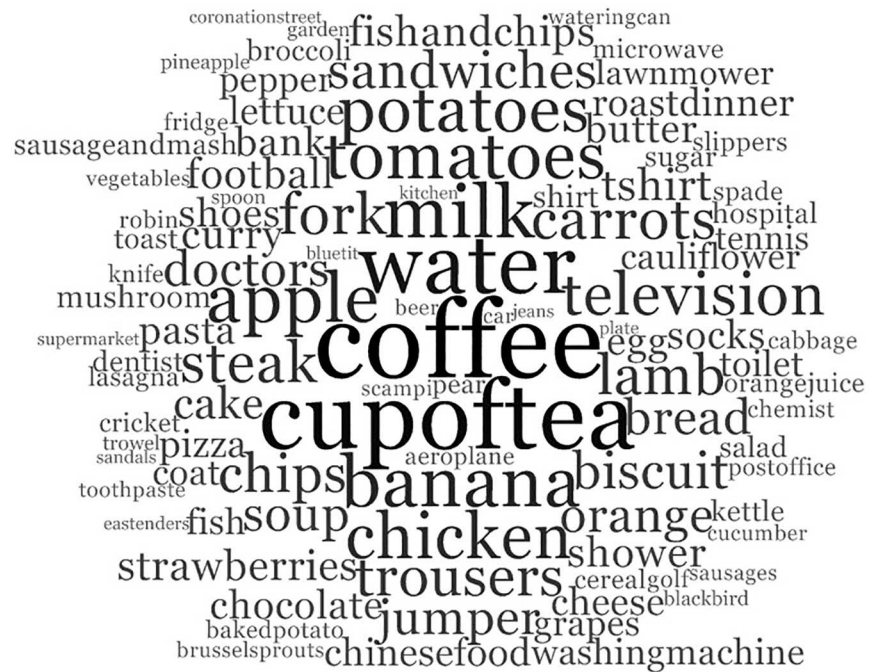
Fig 2. Words chosen with the greatest frequency.

https://doi.org/10.1371/journal.pone.0174065.g002