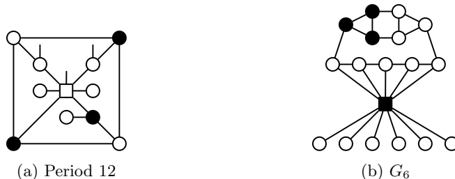
Figure 3: Graphs with more general rules at v_1

Finally we give an example of a triangle-free graph on which period 12 is attained, together with a general construction to show that any period is possible without the restriction that v_1 is not in a triangle. In each case a more complicated rule is required at v_1 . In Figure 3a, v_1 takes state +1 at time t + 1 if and only if |N_1 \cap U_t| \in \{0, 2, 3, 4\} , and every other vertex follows the majority rule.