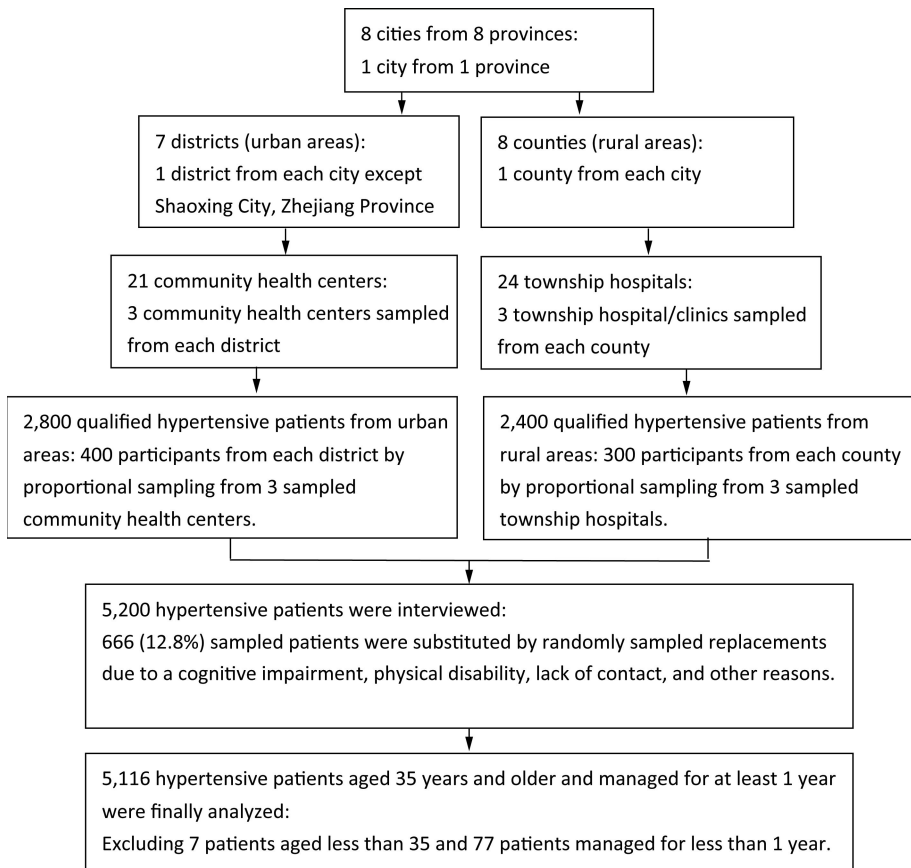
Figure 1. Flowchart for the selection of the samples.

Questionnaires were used to collect information on the socioeconomic status, health knowledge, modifiable indicators of a hypertension risk, and health service utilization. The interviews were conducted in person by trained workers from the local CDC. The demographic, socioeconomic, and clinical factors that were investigated included gender, age, marital status, education, household income, medical insurance, and the duration of hypertension diagnosis. The standardized management was the main analytical factor measured. If the local primary health care workers followed up with a hypertensive patient at least four times during the last year and if they measured the patient's blood pressure, enquired about relevant symptoms, and provided healthy lifestyle advice during each follow-up, the patient was considered to have received the standardized management.