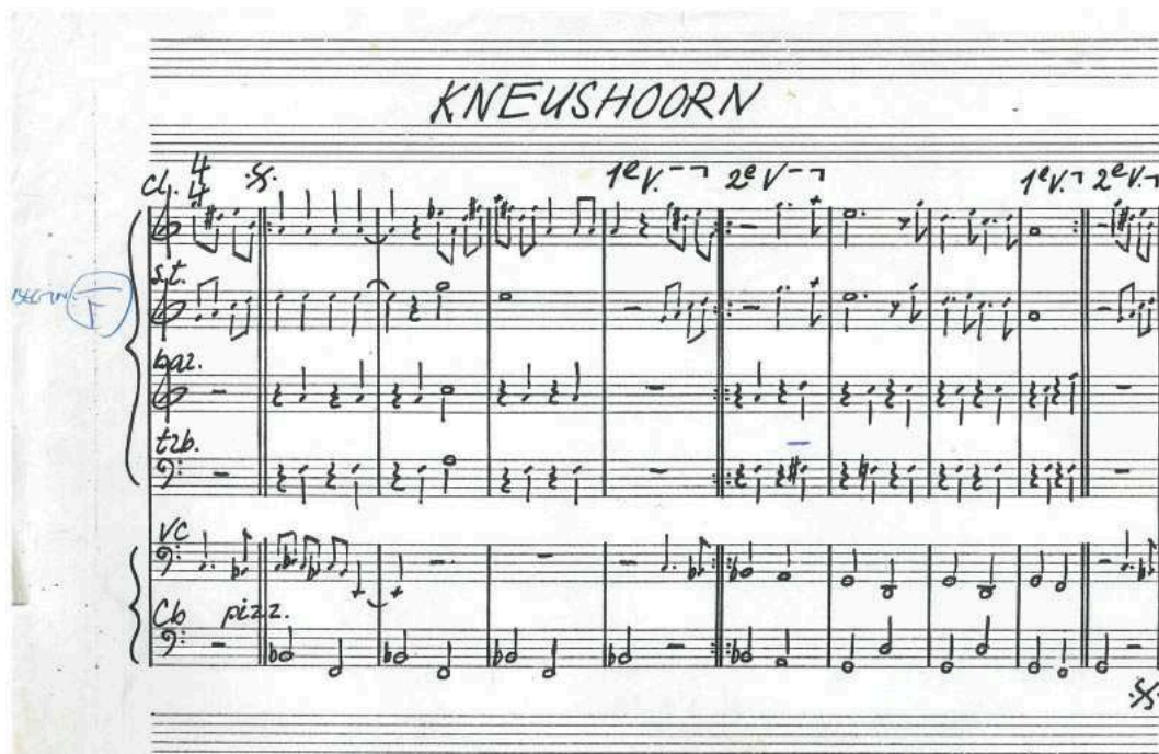
Ex. 6. Wierbos's copy of Kneushoorn, with 'Begin F' in the margins.