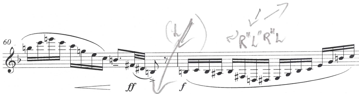
Ex. 5. 'Czardas' (b. 61) with Archibald's annotations (basset clarinet part).