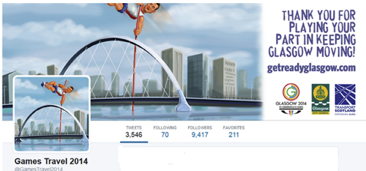
Fig. 1. Branding for @GamesTravel2014 Twitter account (accessed 14 May 2015).