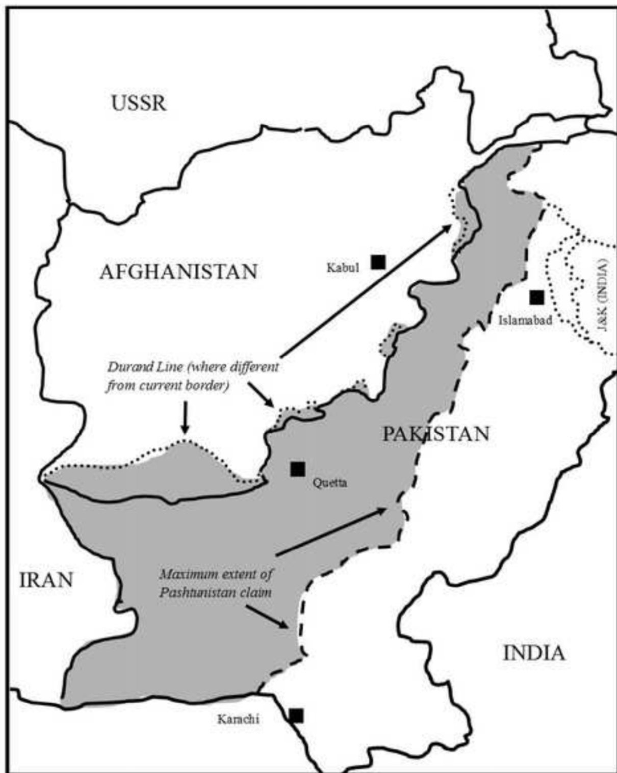
Figure 3. The shaded area represents the Pashtunistan claim on Pakistan-administered territory