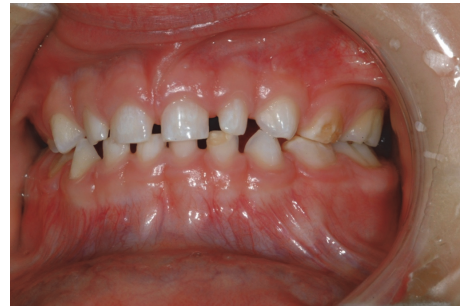
FIGURE 3: Photograph showing the enamel hypomineralization affecting the labial surface of the upper anterior teeth, hypoplasia in 72, and hypomineralization in 64 and 74.

2.2. Radiographic Examination. The patient’s general dental practitioner sent an orthopantomogram (OPG) radiograph (Figure 4) and we have taken bitewing radiographs for caries assessment and diagnosis. The radiographic image showed 55 and 54 with classical radiographic features of “ghost teeth,” with a thin radioopaque contour, showing poor distinction