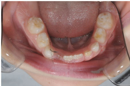
FIGURE 6: Lower arch, posttreatment.

with area of enamel opacity on the mesial aspect of the palatal wall. Hence, the tooth was fissure sealed using Fuji Triage™ to prevent plaque accumulation.