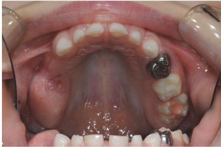
FIGURE 5: Upper arch, posttreatment.