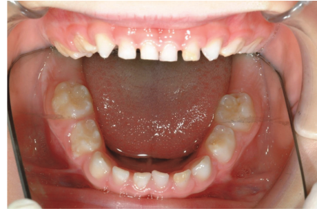
FIGURE 2: The lower arch.

with open apices [30]. The distinctive “ghost appearance” of these teeth is due to the wide pulp chamber [1, 22, 24] and the reduced thickness of enamel and dentine with loss of demarcation between these tissues.