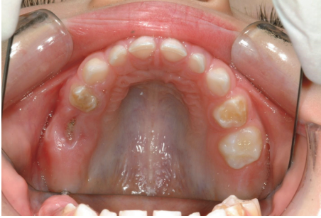
FIGURE 1: Broken down 55 to subgingival level and hypomineralization and hypoplasia of 54 and 64.