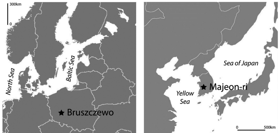
Figure 1. Location of sites investigated in Europe and East Asia (Adobe Illustrator CS4 14.0.0. http://www.adobe.com/uk/ ).