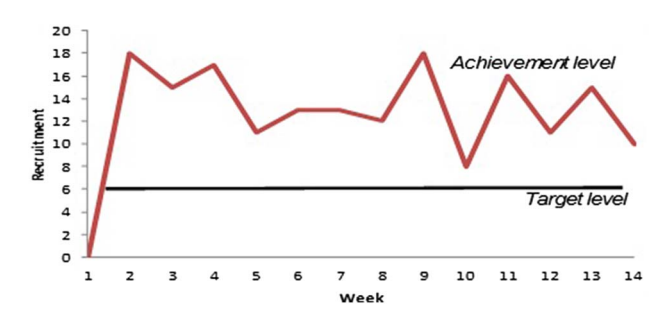
Figure 2 Rate of participant recruitment for the MaBEL study. MaBEL, Mother's and Baby's Exposure to Lead.

While the majority of antenatal blood samples (n=172) were collected by the CI, a protocol was developed for the collection of meconium samples that included