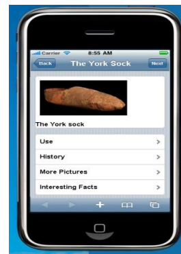
Fig. 4. The first page after user click on available objects in G-tour