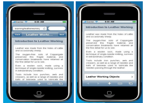
Fig. 2. A snapshot of a page in the G-tour.