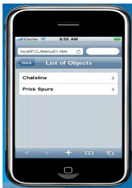
Fig. 3. The interface for object selection in FC-tour;