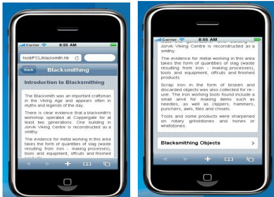
Fig. 1. A snapshot of a page in the FC-tour;

visitors as they can select which object of their interest without have to views information of the object they don't like to view.