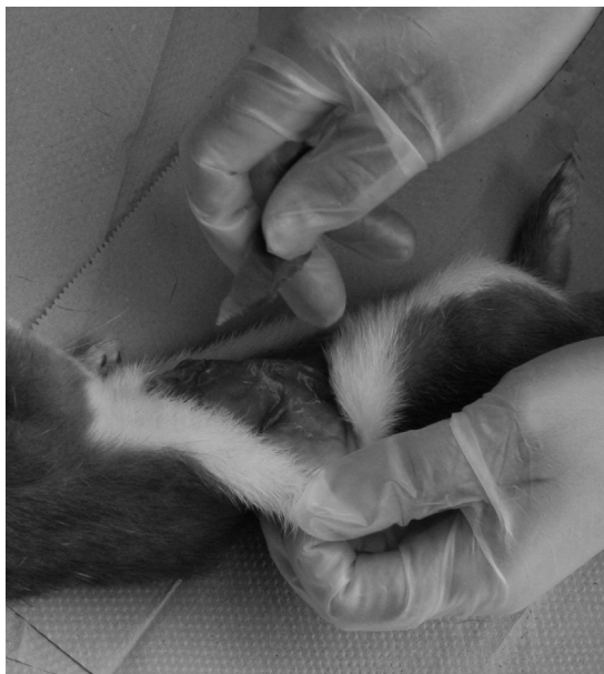
Figure 4.6 The flint used to skin the second stoat.

The ease with which the skin parted from the carcass felt the same as it had with the unfrozen carcass, reinforcing the impression that, for stoats at least, there is no difference between skinning a fresh and frozen carcass. The areas where it was felt some marks could be left on the bones were again perhaps the sternum and definitely over the skull. Once again the vent area was treated with great caution, as this appeared to be an older male and the smell was already very strong without puncturing the scent glands. As with the first stoat, the tail was the most difficult to skin, and again it was not skinned successfully. This time the end of the tail broke off completely, pelt and bone, away from the rest of the carcass and pelt.