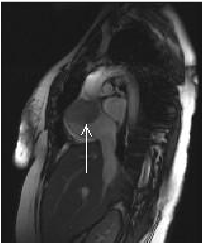
Figure 1 MRI of the heart showing low signal density in the right atrial (arrowed) representing metastasis.

However an emergency Caesarean section was performed at 31 weeks gestation because of ante-partum haemorrhage. The baby delivered weighed 1.5 kg with no signifi-