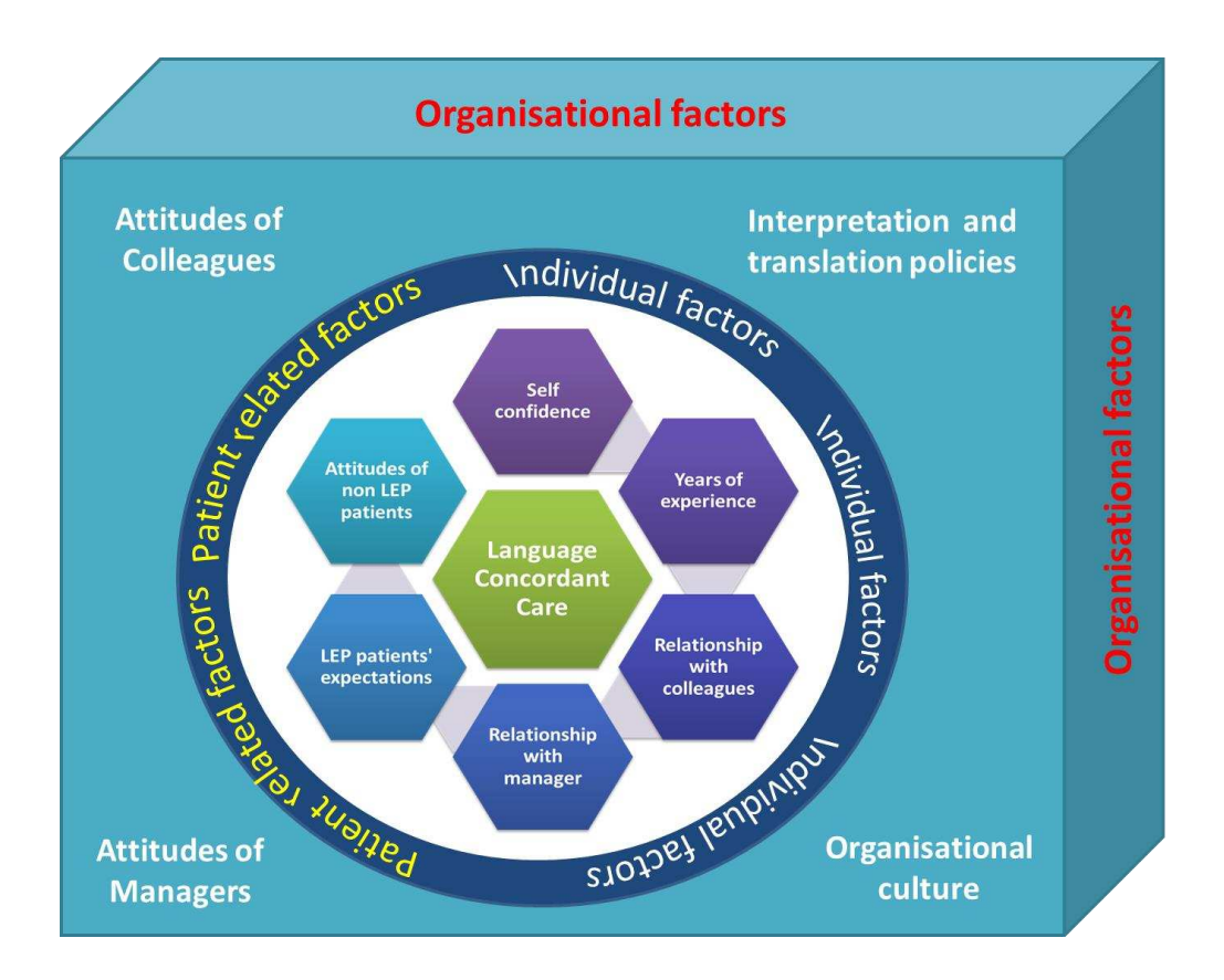
Figure 2: Factors affecting provision of language concordant care