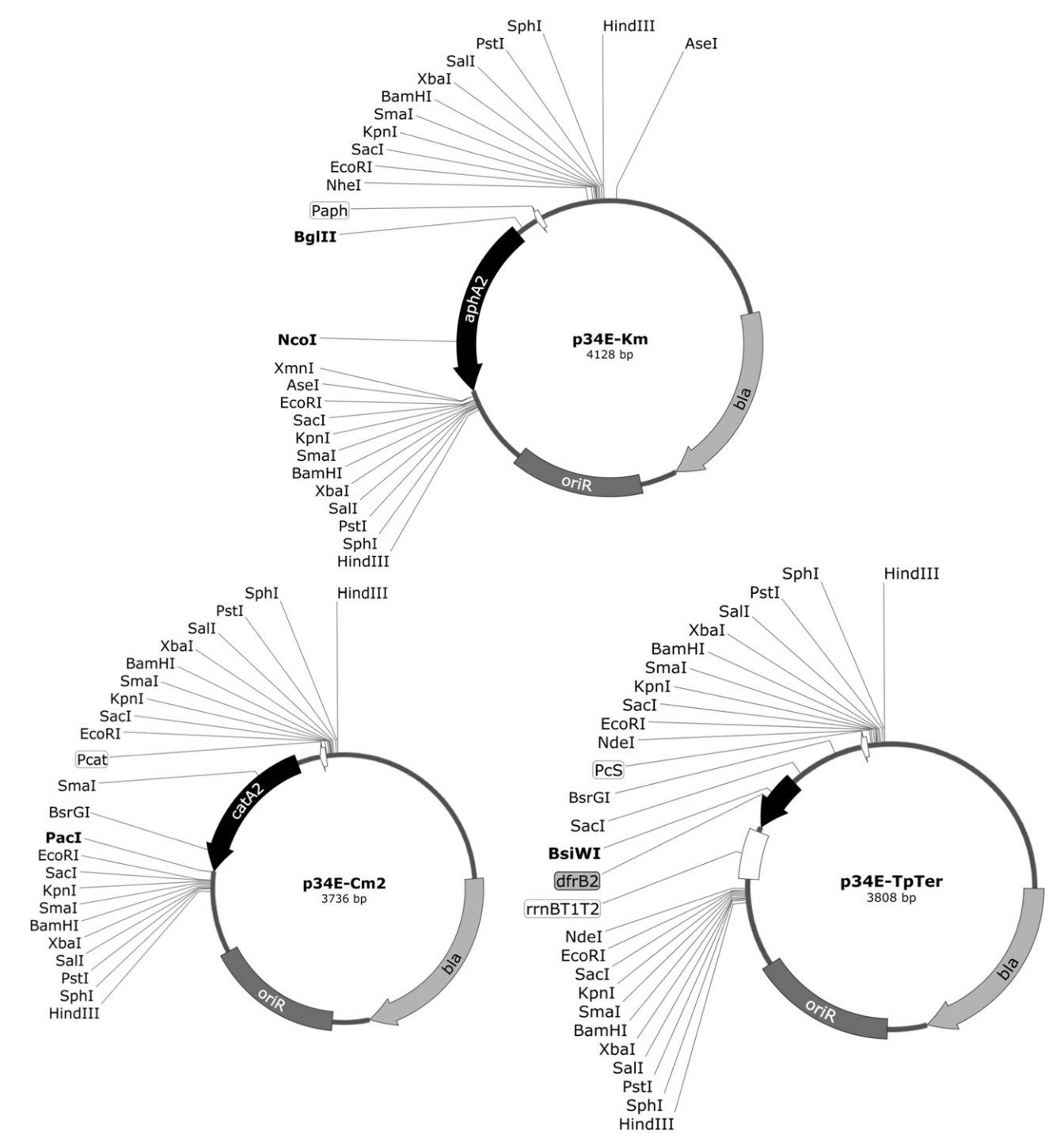
Fig. 1. Maps of novel antibiotic-cassette vectors. The location of antibiotic resistance-conferring genes, bla (ampicillin-resistance), aphA2 (kanamycin-resistance), catA2 (chloramphenicol-resistance) and dfrB2 (trimethoprim-resistance), and the plasmid ColE1 origin of replication (oriR) are indicated for plasmids p34E-Km (top), p34E-Cm2 (left) and p34E-TpTer. Dual-cutting restriction sites that can be utilised to excise the antibiotic resistance cassette are also shown, as are internal sites that can be used for determination of the orientation of the cassette following insertion into a target gene. Restriction sites that occur only once in each plasmid are shown in bold. Note that additional sites for Asel, BsrGI, Nhel and Xmnl occur in the backbone of all three vectors that for clarity are not shown. Promoters for the cassette antibiotic-resistance genes are shown (P<sub>aph</sub>, P<sub>cat</sub>, P<sub>cS</sub>). Maps created with SnapGene® software (from GSL Biotech; available at snapgene.com).

S. Shastri et al. / Plasmid 89 (2017) 49-56