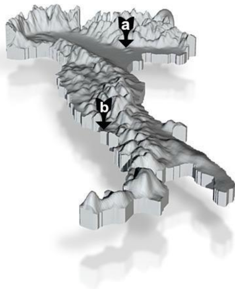
Fig 1. Location of Bovolone (a) and Sant'Abbondio (b).

Bovolone, in the province of Verona, is a Bronze Age necropolis excavated a number of times since 1876. The individuals sampled for this study belong to the excavations carried out between 1981 and 1983 concerning the Middle Bronze Age area of the necropolis [4]. 64 graves were recovered during these campaigns, 29 of which are burials.