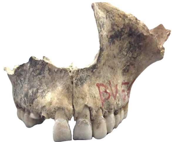
Fig. 2. Bovolone, burial 56 (T56). Calculus sampled from the labial surface of the upper incisors.

We performed a shotgun metaproteomic analysis of 9 samples of dental calculus; 6 samples from Bovolone, and 3 from Sant'Abbondio. Deposits of dental calculus were removed from the tooth surface using a sterile dental scaler. Only supragingival calculus has been sampled, predominately from premolars and molars (Fig. 2), and collected in 2.0 mL tubes. We used between 1.9 and 26.7 mg of dental calculus for protein extraction.