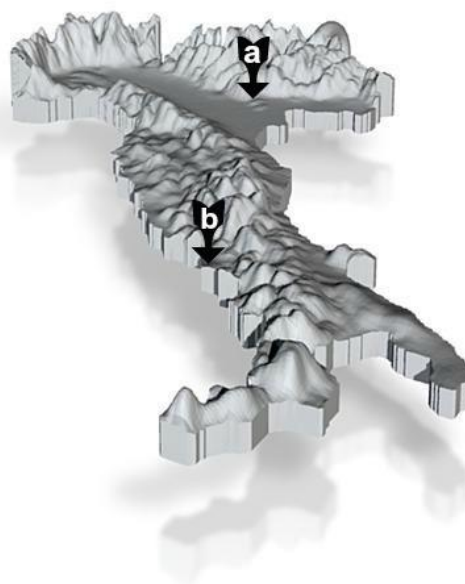
Fig 1. Location of Bovolone (a) and Sant'Abbondio (b).

Bovolone, in the province of Verona, is a Bronze Age necropolis excavated a number of times since 1876. The individuals sampled for this study belong to the excavations carried out between 1981 and 1983 concerning the Middle Bronze Age area of the necropolis [4]. 64 graves were recovered during these campaigns, 29 of which are burials.