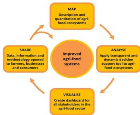
Fig. 1 The MAVS cycle, a novel 4-step methodological iterative process to achieve optimised interventions to increase the sustainability and security of agri-food systems.

The theoretical framework for improvement of agri-food systems is based upon mapping of whole agri-food systems, their quantitative analysis based on enhanced life cycle assessment, the use of emergent data to catalyse viable and commercially attractive innovation and the free access of data to all stakeholders and in particular consumers as the principle engine for change. It is an iterative methodology involving four overlapping steps (Map, Analyse, Visualise and Share, the MAVS cycle), as shown in Fig. 1.