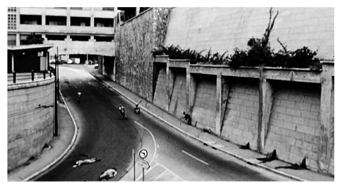
Aftermath of an FLN action at the foot of the Aéro-Habitat building