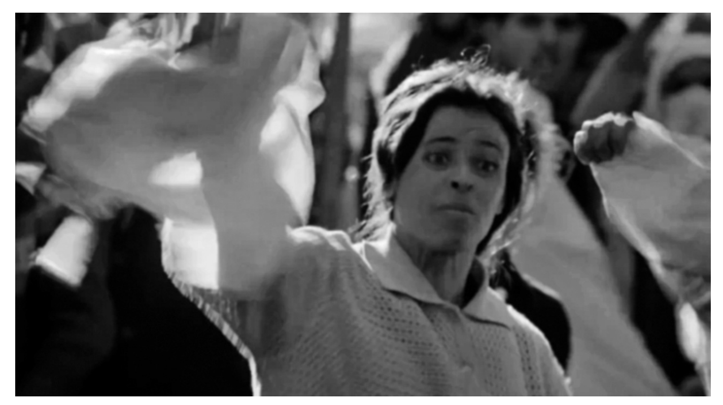
An Algerian woman celebrates a space of possibility.

taken place in Algiers: migration generated shantytowns, worries about security, and then building on a large scale to accommodate the newcomers. The French banlieues tend to have inadequate infrastructure and high unemployment and to be aggressively policed. As Fielder notes, the term banlieue designates a space "excluded" from the city even as it and its residents are subject to its jurisdiction.<sup>51</sup> Consequently, such districts have often been the site of protests and riots and, beginning in the 1980s, generated a version of social problem cinema which the Cahiers du cinéma has dubbed the "banlieue film," the best known example of which is La Haine (Hate, Mathieu Kassovitz, 1995). The banlieue film (defined like the western by its geographical location, as Will Higbee points out) typically employs a realist aesthetic that presents the "alienating architecture" of the housing estates to figure the marginalization of its young male protagonists.<sup>52</sup> However, in this cinema, the meaning of the banlieue itself cannot be reduced solely to alienation because it also "remained the only real space of community and belonging."53