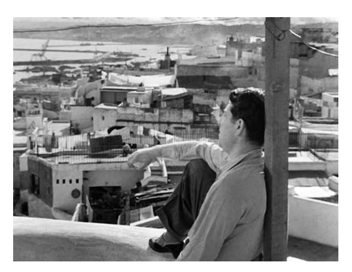
Jean Gabin surveys the Casbah in Pépé le Moko (1937).

The opposition between European city and Casbah is a means to efficiently narrate the story while making the argument for anticolonial struggle in terms that are legible at home and abroad.<sup>25</sup> As such, it also points to the film's address to the wider world on behalf of the FLN and new Algerian nation-state.<sup>26</sup> But in failing to account for spaces in the film that are neither European city nor Casbah, Battle scholarship shows itself to have been seduced by the film's own rhetoric. The hybrid, third spaces that appear in the film's remarkable six-minute coda are key to its status as an "end of French empire" film. The new housing projects of Algiers that are glimpsed in the coda anticipate the banlieue districts which will grow up outside city perimeters in France in the period