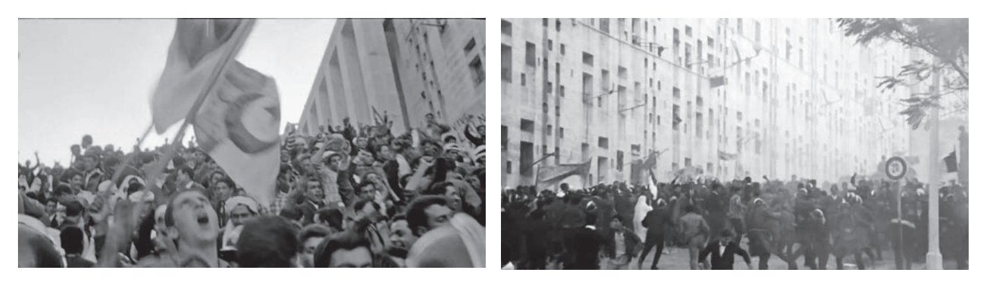
The 200 Columns building becomes the backdrop to the people's struggle.

containment in the rest of the film). However, the coda's formal representation of the Climat de France buildings and the structures they impose on its representation do echo the mise-en-scène and framing of the buildings and elevations seen earlier in the film, contributing to the power of this ending.