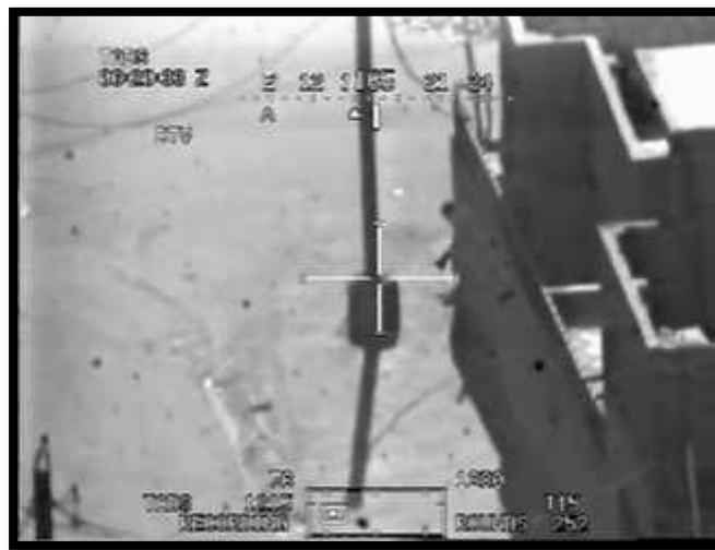
Figure 1. The view from above.

were photographs taken before and during the attack by killed Reuters journalist Namir Noor-Eldeen and video of testimony by and images of a US soldier, Private Ethan McCord, who had been a member of the unit tasked with the 'clean up' after the attack and was visible in the Apache footage. Three visual configurations were therefore at play in the text. They mapped onto three locations of war experience and violence, and three associated war subjects. The first mode of vision is the view from above: the perspective of the Apache helicopter crew through the gun sight, which would have been their means of seeing the ground far below (Figure 1). The second is the view from below: the perspective of killed Reuters photojournalist Namir Noor-Eldeen (Figure 2) who took photographs up to the moment of the attack (Figure 3), including of the sky; a return of the downward gaze. The third is the view of the 'on-the-ground eyewitness': Private Ethan McCord who is seen briefly in the Apache footage carrying an injured child from a shot-out vehicle. A video of his speech at a peace conference is intercut with photographs apparently taken by soldiers including one of him stained with the blood of the children he carried (Figure 4).