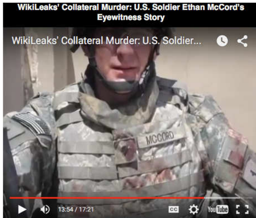
Figure 4. The view of the on-the-ground eyewitness