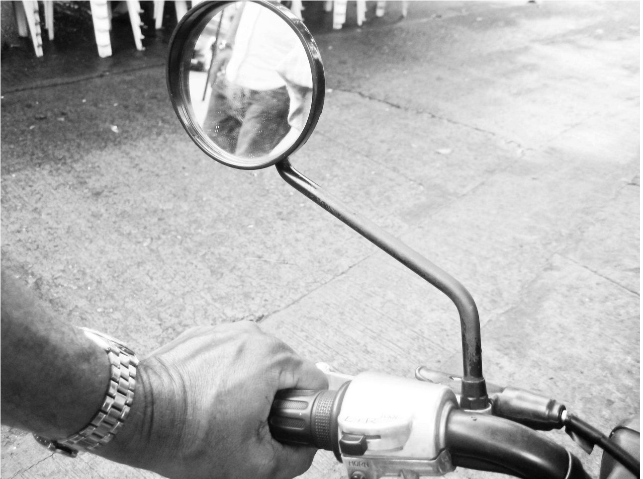
Figure 1. Photo 2 in Preet's photo story.