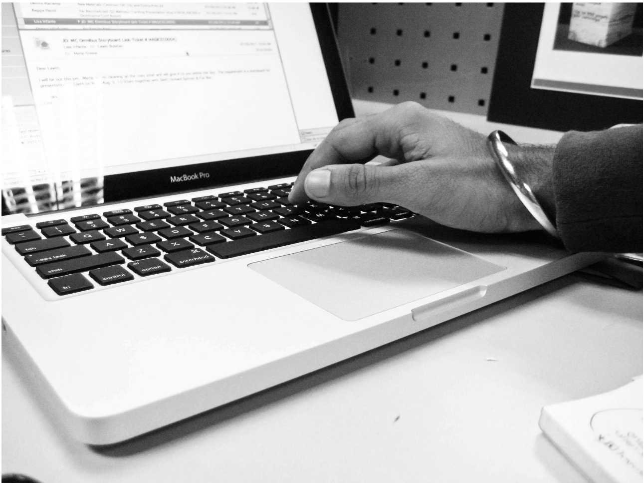
Figure 7. Photo 6 in Preet's photo story.