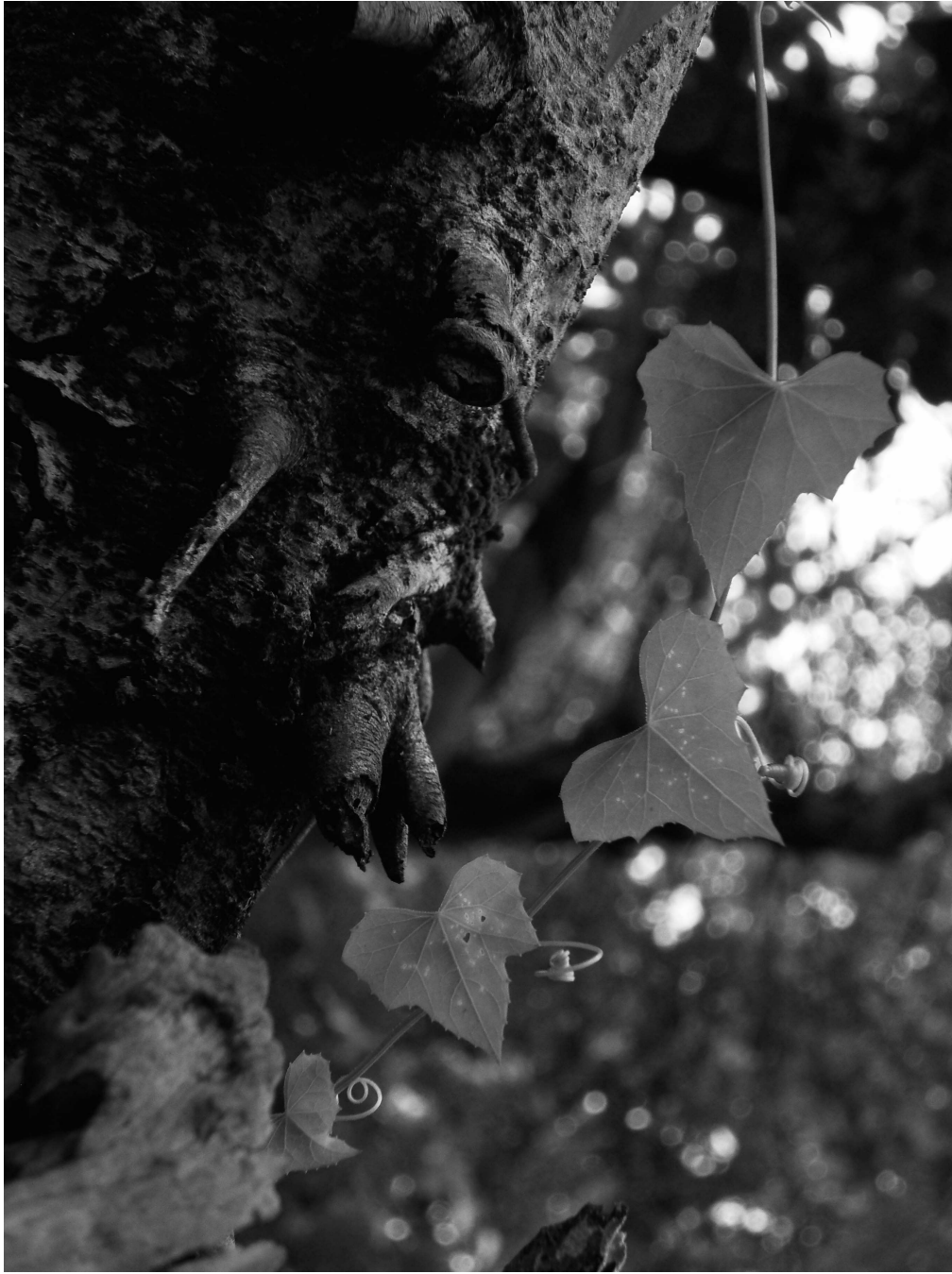
Figure 5. Photo 23 in Hae Jin's photo story.