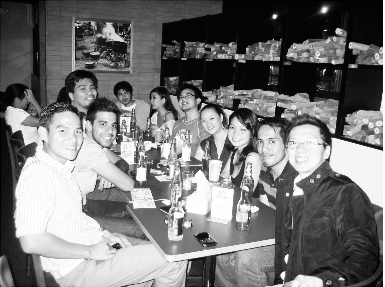
Figure 2. Photo 13 in Preet's photo story.