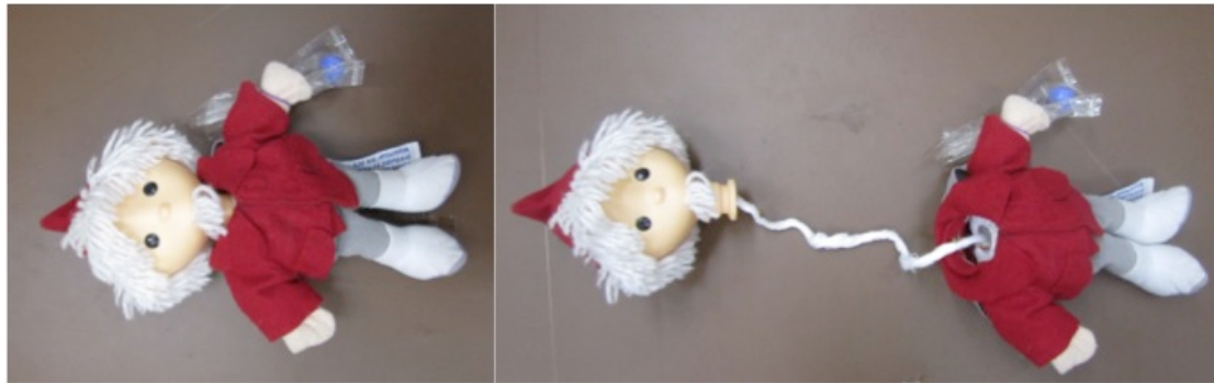
Figure 1. Photographs of the doll intact (left) and broken (right)