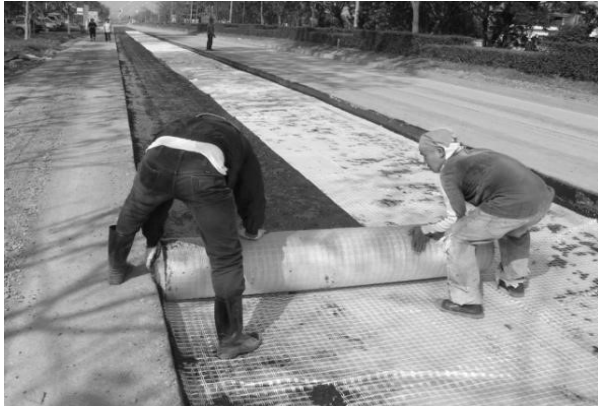
Figure 1. Photograph showing an installation of geotextile in a test section.

especially ruts. The rut depth measurements in this section yielded an average rut depth of 30 millimeters, which is considered as a severe rutting failure [2]. The construction of the test sections is shown in Fig. 1 and Table 1.