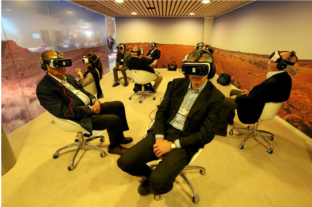
Delegates watching a virtual reality film at the World Economic Forum 2016. Photo: Moritz Hager, Swiss-image.ch. Creative Commons Attribution-NonCommercial-ShareAlike 2.0 Generic License

1 2 3 4 5 6 7 8 9 10 11 12 13 14 15 16 17 18 19 20 21 22 23 24 25 26 27 28 29 30 31 32 33 34 35 36 37 38 39 40 41 42 43 44 45 46 47 48 49 50 51 52 53 54 55 56 57 58 59 60