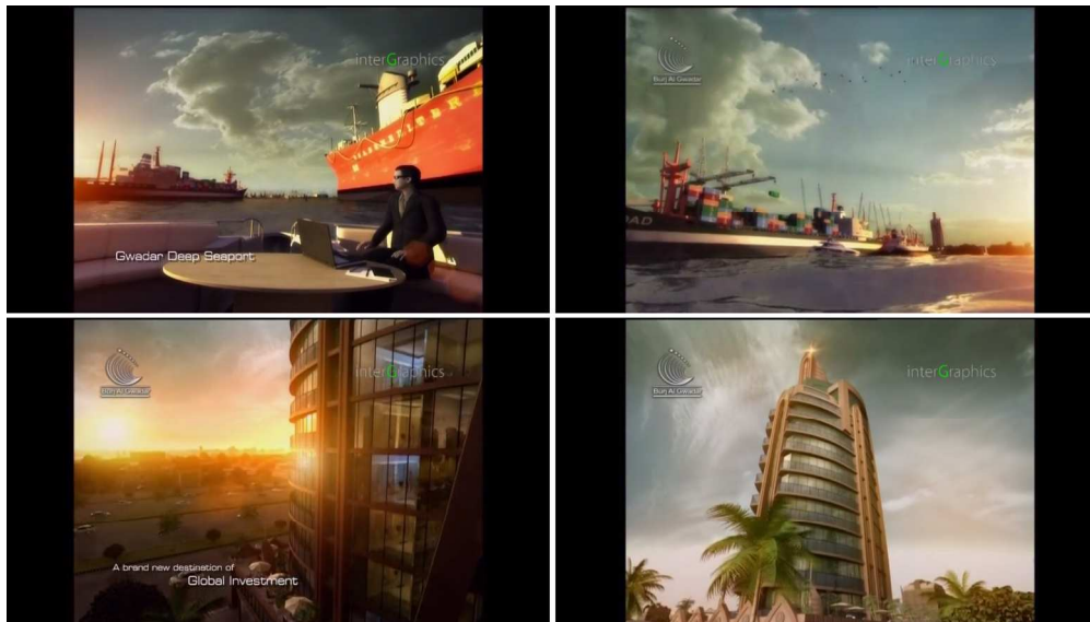
Stills from promotional video of Bur Al Gwadar. Available to view at: https://www.youtube.com/watch?v=Ah1yFFrM5Lc

1 2 3 4 5 6 7 8 9 10 11 12 13 14 15 16 17 18 19 20 21 22 23 24 25 26 27 28 29 30 31 32 33 34 35 36 37 38 39 40 41 42 43 44 45 46 47 48 49 50 51 52 53 54 55 56 57 58 59 60