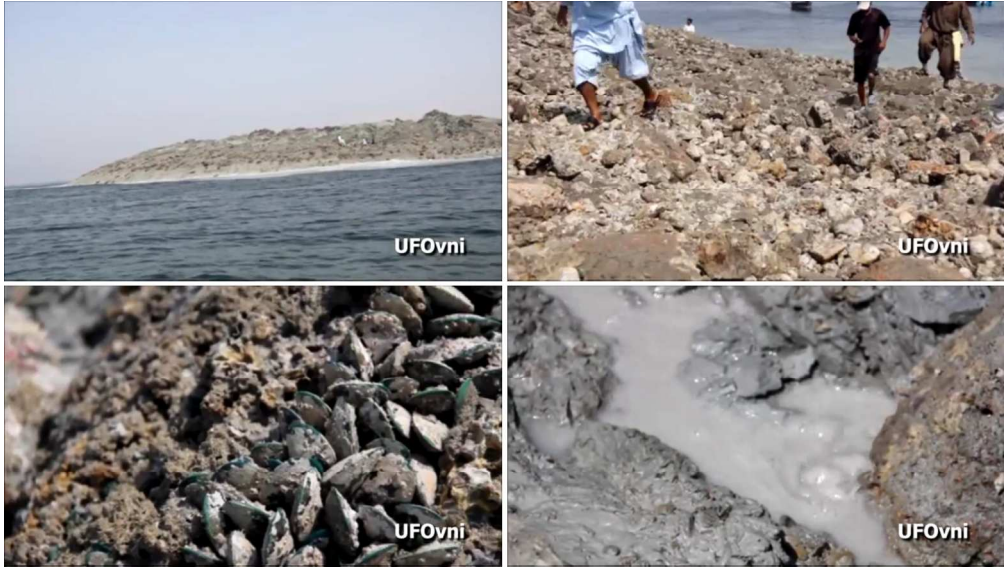
Stills from Zalzala Jazeera video. Original video adapted for the UFOvni account available to view at: https://www.youtube.com/watch?v=_AWxtzrhSHs

1 2 3 4 5 6 7 8 9 10 11 12 13 14 15 16 17 18 19 20 21 22 23 24 25 26 27 28 29 30 31 32 33 34 35 36 37 38 39 40 41 42 43 44 45 46 47 48 49 50 51 52 53 54 55 56 57 58 59 60