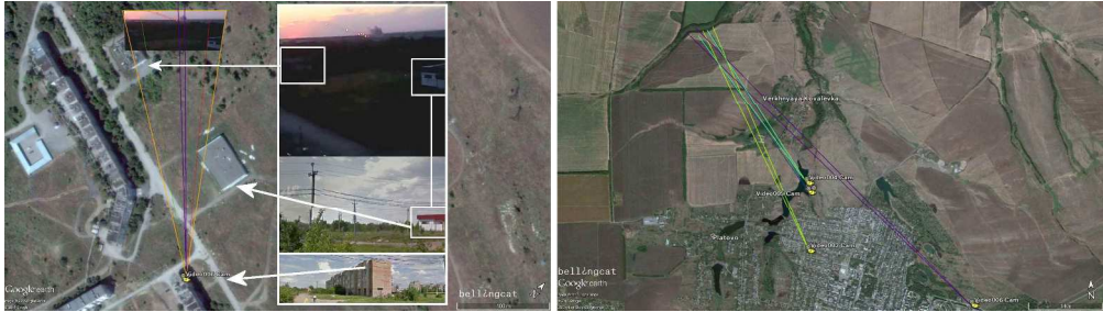
Video analysis determining direction of firing in Ukraine (for more info see: https://www.bellingcat.com/news/uk-and-europe/2015/02/17/origin-of-artillery-attacks/ ).

1 2 3 4 5 6 7 8 9 10 11 12 13 14 15 16 17 18 19 20 21 22 23 24 25 26 27 28 29 30 31 32 33 34 35 36 37 38 39 40 41 42 43 44 45 46 47 48 49 50 51 52 53 54 55 56 57 58 59 60