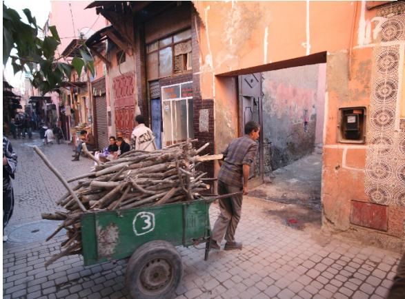
Figure 2 Delivery of wood shavings

investment was estimated at 10 months (the cost of the improved furnace being 982,000 Moroccan Dirhams). The estimated economy on biomass consumption was at 166 tonnes per year per hammam. i.e. a cost of 106,240 Dhs/year, bearing in mind that a ton of wood for the furnace costs 640 Dhs. [6]. With this return on investment, it might be thought that demand would be high. However, hammam owners expressed scepticism over the new technology and, as already successful businessmen, the owners had little incentive to upset a profitable business model. The initial plan was to implement this improved furnace in 1,000 hammams in Casablanca, 40 in other Moroccan cities and 30 in rural areas [7]. However, the high initial investment cost and scepticism have acted as a major deterrent to most hammam managers.