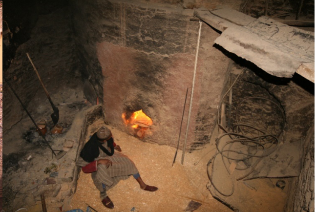
Figure 3 The traditional furnace area in hammam Deb Marrakech.