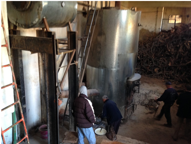
Figure 4 The improved furnace at hammam al Karam, Marrakech