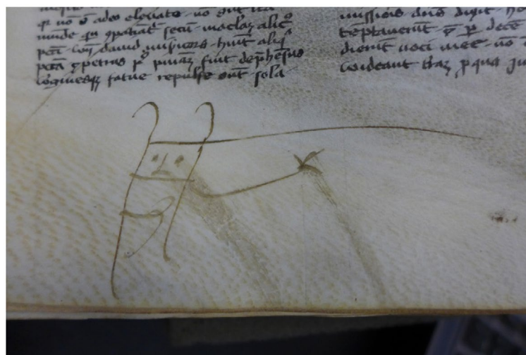
Figure 3. LJS 361, Kislak Center for Special Collections, Rare Books and Manuscripts, University of Pennsylvania Libraries folio 23r.

depict both head and body. Additionally, as in the Pompeii graffito, similar simple lines are used to denote both upper and lower limbs.