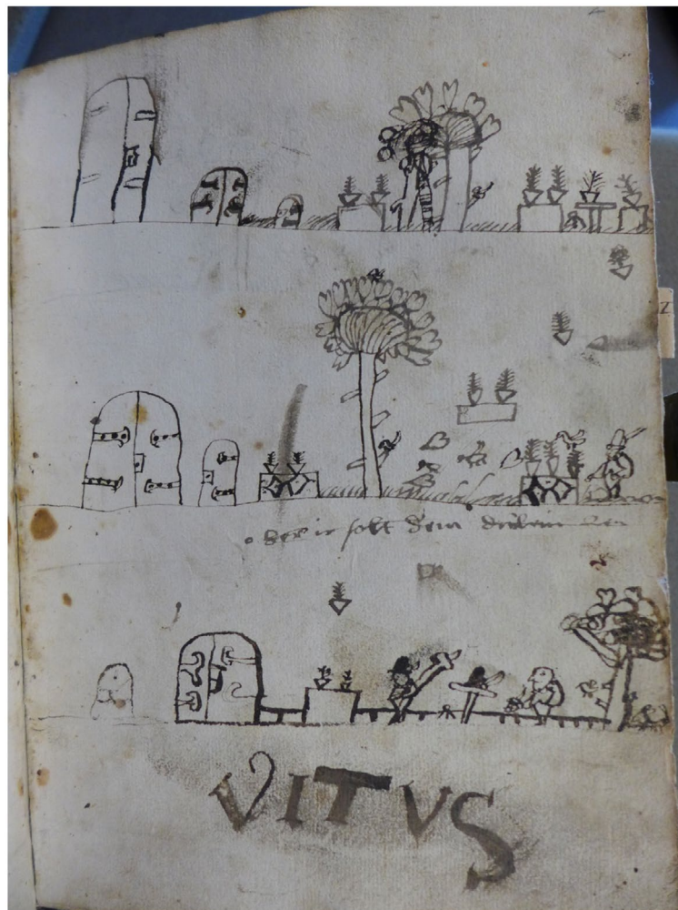
Figure 4. LJS 445, Kislak Center for Special Collections, Rare Books and Manuscripts, University of Pennsylvania Libraries folio 2v.

This image exudes childishness in its repetition of schemas (for example, in the doors, trees and birds); its “lollipop” trees with stylised heart-shaped leaves; and its clumsy lines with little regulation of thickness. However, it also displays side-on (rather than canonical) human figures wearing hats, ornate collars and pantaloons. The drawing conveys motion, as leaves fall, birds fly and people walk. These figures witness the slow replacement of intellectual realism with visual realism as a child ages, as well as the increasing repertoire of dynamic postures of the human figure, moving beyond the static, canonical, depictions typical of younger artists.