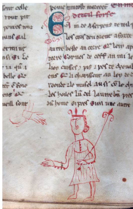
Figure 5. LJS 55, Kislak Center for Special Collections, Rare Books and Manuscripts, University of Pennsylvania Libraries folio 10v.