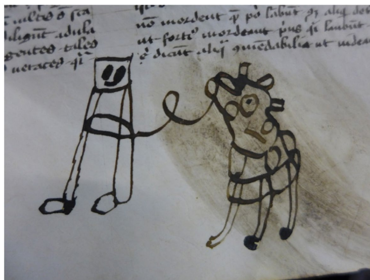
Figure 1. LJS 361, Kislak Center for Special Collections, Rare Books and Manuscripts, University of Pennsylvania Libraries folio 26r.

In personal correspondence (April 18, 2015), developmental psychologist Rosalind Arden of King's College London indicated that the human standing to the left of the animal in Figure 1 is typical of this "tadpole" as drawn at around age 4.