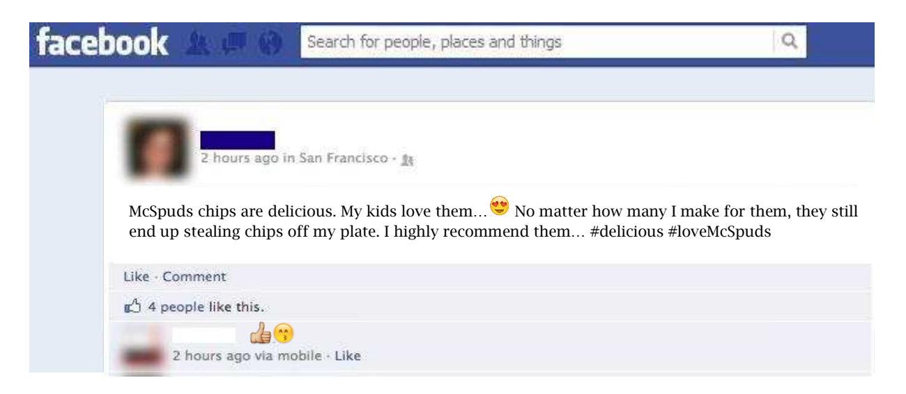
Figure 2. Stimulus for UGBR.