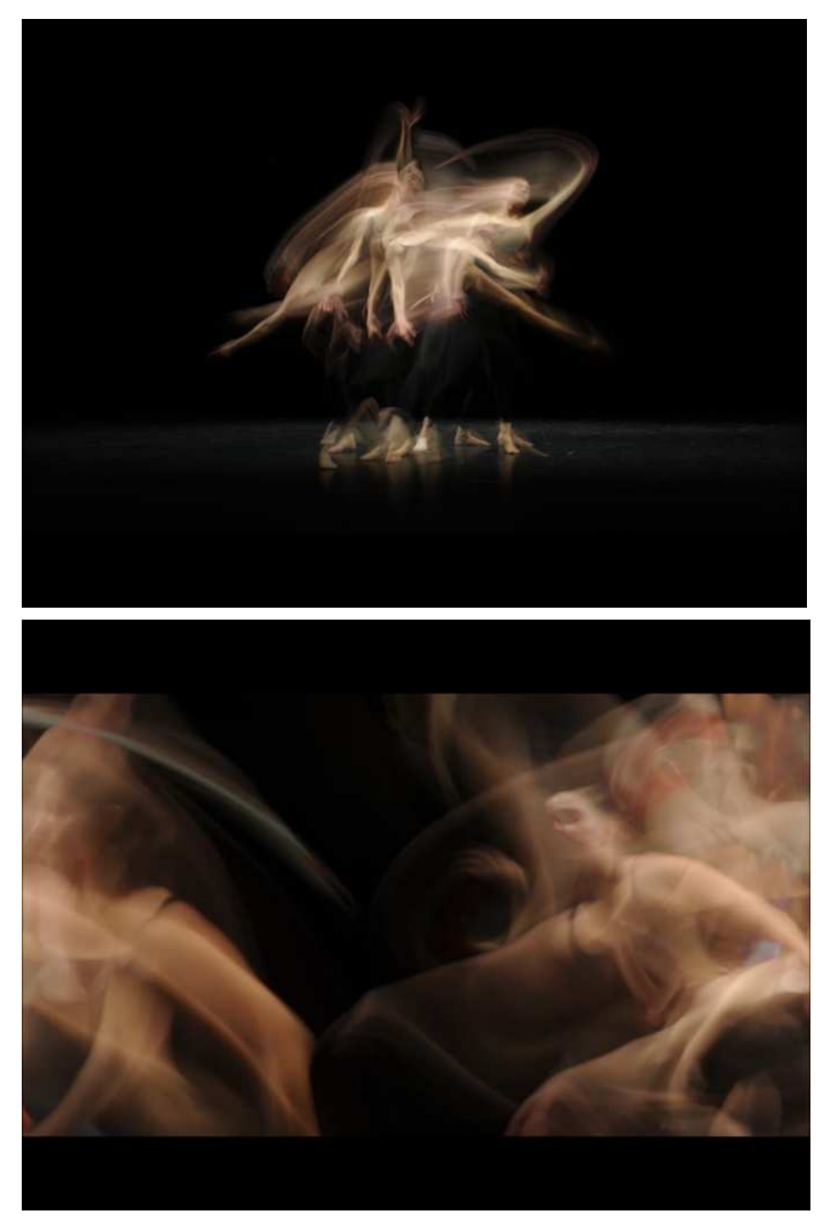
Figs. 7 and 8 Labanimations 2 and 3 (studies of dynamic stress)