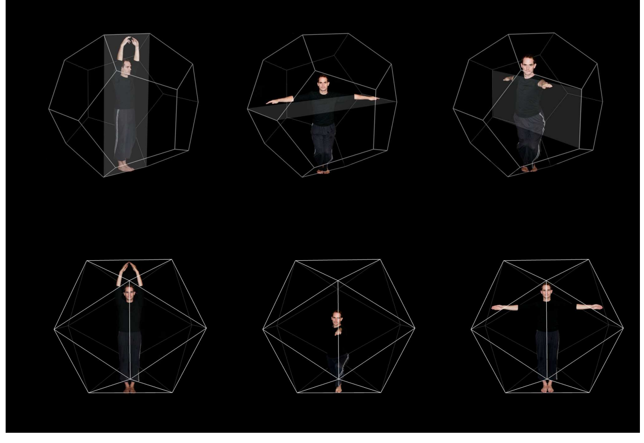
Figs. 4 and 5. Dodecahedral and Icosahedral forms of the kinesphere, representing the three cardinal planes (vertical, horizontal and sagittal)

backward, to a left upstretched arm. The octahedral form of the kinesphere illustrates a similar idea, only in terms of dimensional orientations in three axes (upward-downward, right-left, forward-backward), and which Laban used in order to develop dimensional scales and the so-called defense scale.<sup>8</sup> The next two solids are so closely related, in geometrical terms at least, that they cannot be treated separately in Laban's thesis. But because the dodecahedron has less volume than the icosahedron, and because it encourages smaller and inward movements that relate to stability, Laban all but does away with this particular object. The icosahedron, on the other hand, is elevated by Laban as the ideal Platonic solid wherein to train and gain knowledge of harmonic relations in space, insofar as it contains all other solids within it. According to Laban, the icosahedron provides the most complete space model for the practice and training of space harmonic relations, not least because the icosahedron offers the appropriate volume and the appropriate angles to match the possibilities of movement of a human body within regular polyhedral space. Finally, Laban found that certain proportions within the icosahedron follow