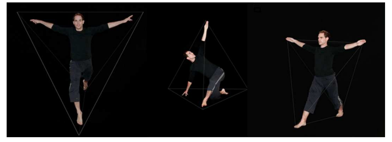
Fig 1. Tetrahedral form of kinesphere, Laban's basic form of plastic human movement