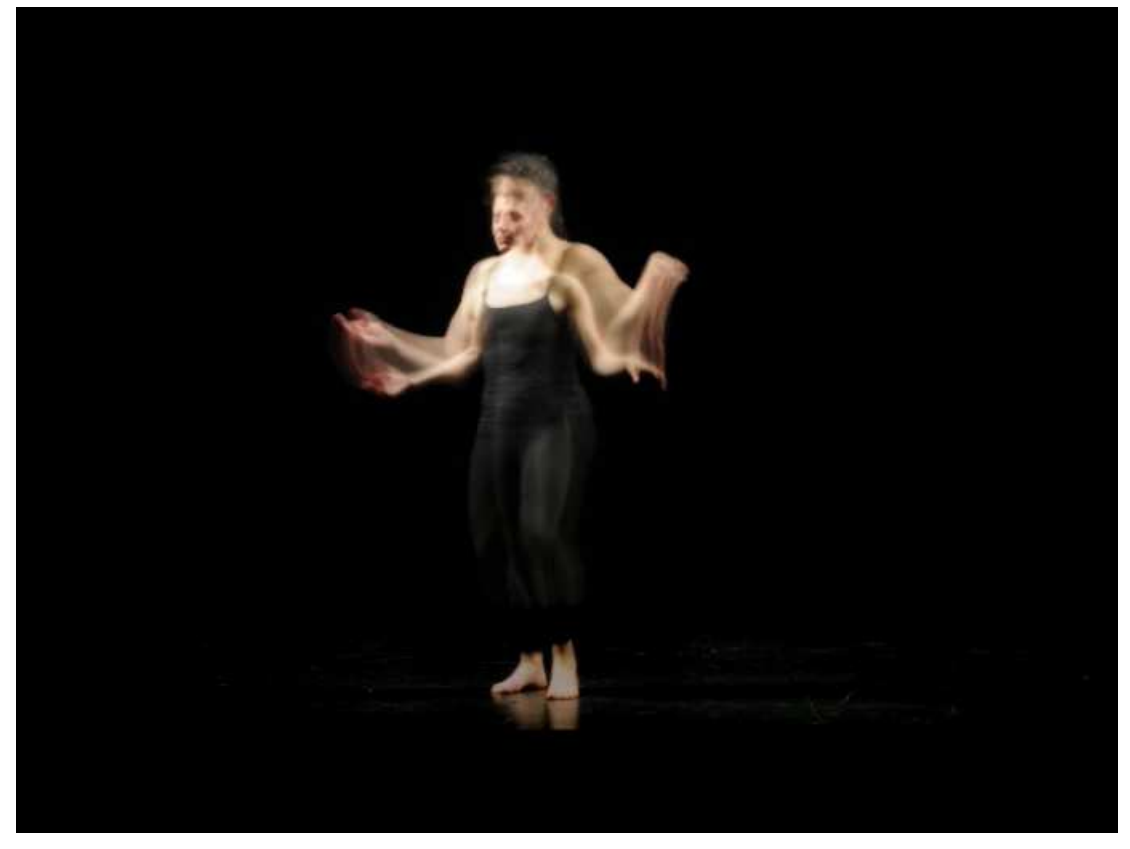
Fig 6. Labanimations 1 (study of shadow forms)

the eyes of a completely different medium capable not only of recognising the added variable of time, but also treating this variable in novel ways.<sup>21</sup> If, in this process of media-translation, a new thinking and a new set of processes for physical thinking are also activated, one has to ask oneself what kind of thinking comes into view as a result of seeing through cameras or computer-generated vision that enable us to see the human body as a moving, and ultimately a topological, object.