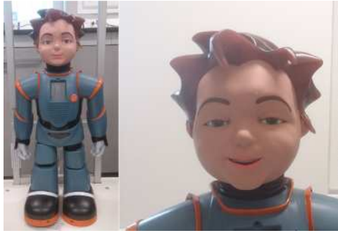
Fig. 1. The Robokind Zeno R25 platform (humanoid figure approximately 60cm tall)

To date, it seems there is no bench-marking of Zeno’s ‘gender’ in the research literature. Appropriate confirmation of this common-sense assumption about a fundamental perception: Zeno’s ‘gender’ is important. Recent literature suggests differences in boys’ and girls’ interactions with, and responses towards, Zeno could be due to their perceptions of the robot as being a boy (who just happens to be mechanical) [5].