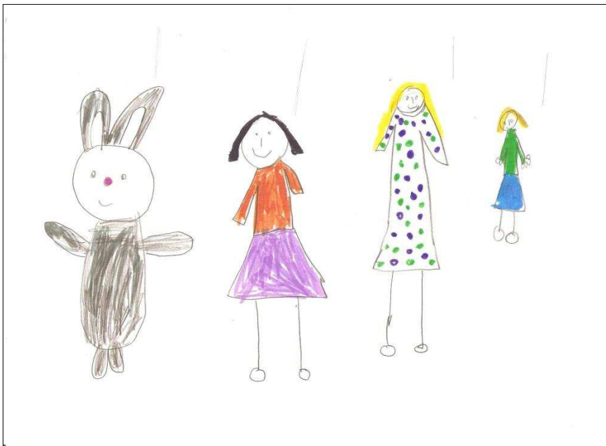
Figure 2 Tell me about your friends