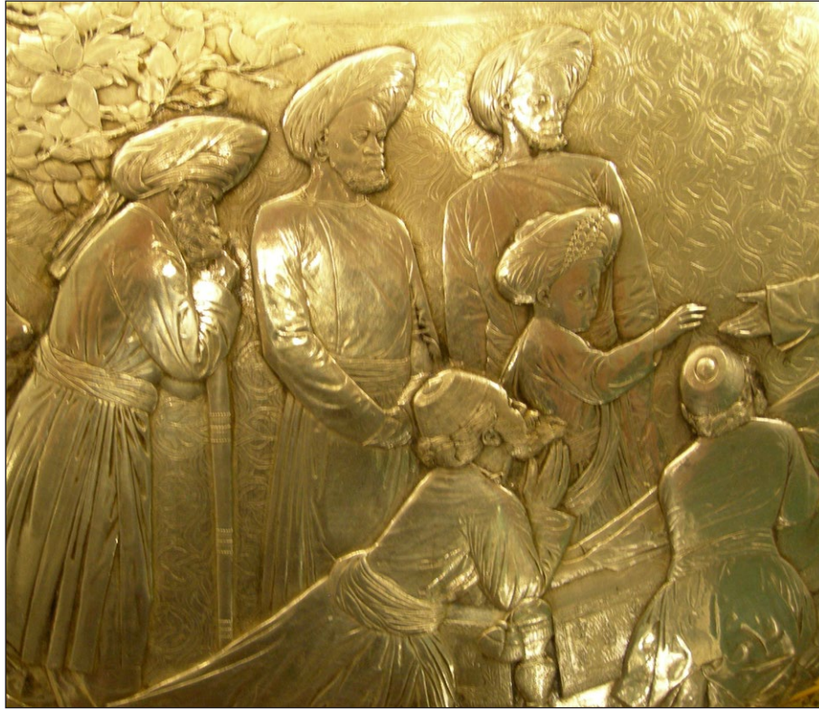
Fig. 42: Henry Hugh Armstead, The Death of the Chieftain . Detail of Fig. 1.

an implied bovine stupidity; and he suggests that the ox seems drawn across the adjacent panels by the familiar scent of man's rear (Fig. 41). Armstead encourages viewers to think further about the aroma of the Amirs' bodies because of the way he foreshortens, and therefore brings closer to spectators' bodies, the faceless right kneeling figure's rear end and the soles of his feet (Fig. 46). 45