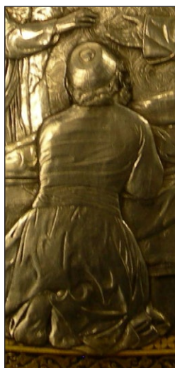
Fig. 46: Henry Hugh Armstead, The Death of the Chieftain. Detail of Fig. 1.

Nativity, and a shared Old Testament heritage, in God's creation of Adam, recalled in The Death of the Chieftain , as we have seen. If Armstead employs Christian iconography, however, his sectarian aesthetic is more Protestant than Catholic, and viewers are not meant to imagine Christianity and Islam as equals. His all-male Protestant 'deposition' lacks a Magdalene, and his 'nativity' a Virgin (Figs. 37, 38). In addition, rather than a humble, Protestant stable, his Islamic 'nativity' takes place against the background of luxurious, oriental textiles and metalwork; the emphatically decorative, calligraphic flourish of the Farsi text in the place of the legible Protestant word (Fig. 25).