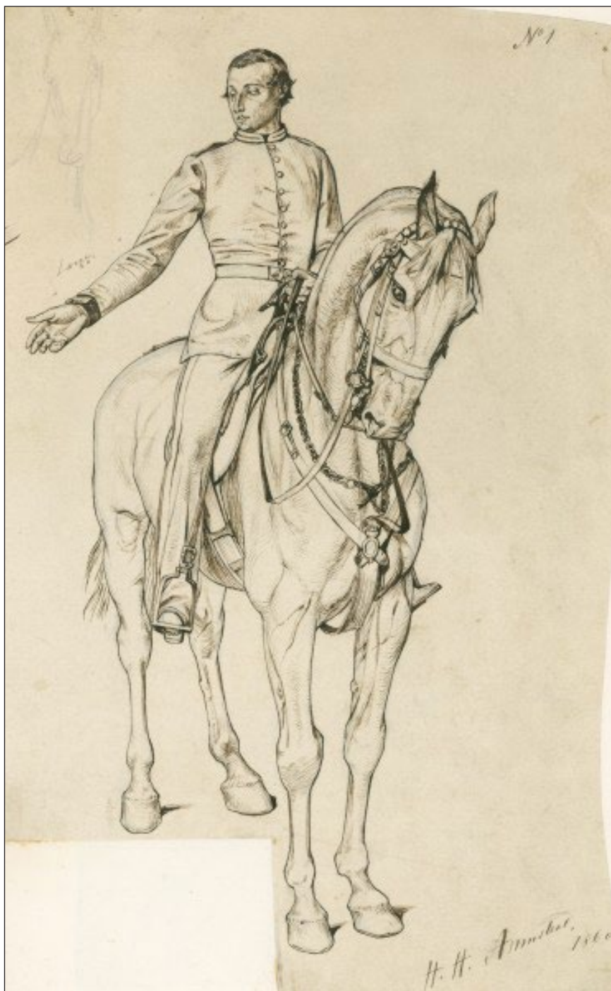
Fig. 63: Henry Hugh Armistead, Study of a Cavalryman for the Outram Shield , c. 1860, pen and ink over pencil on cream wove paper, 322 mm × 192 mm, Royal Academy of Arts, London.