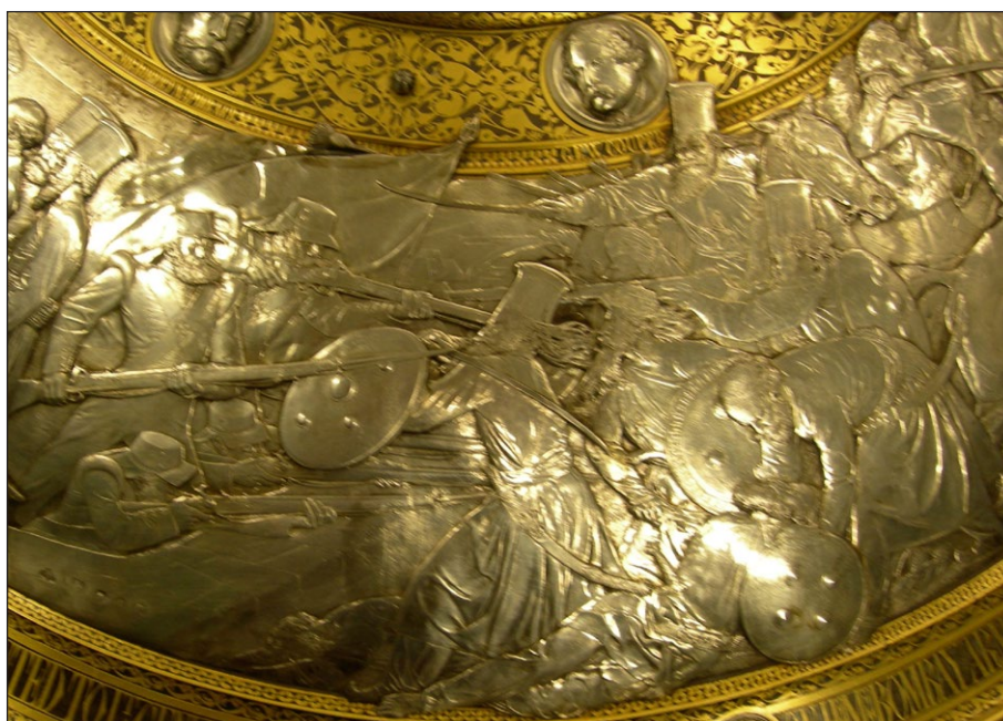
Fig. 47 : Henry Hugh Armstead, The Defence of the Hyderabad Residency . Detail of Fig. 1 .

In addition to ignoring the crucial role played by cannons and naval firepower, in order to maximize the apparent heroism of the army, Armstead depicts just four British soldiers battling ten rebels. The soldiers also have their necks covered, emphasizing the vulnerability of their white skin in the famously hot, dry climate ( Fig. 50 ). Two kneeling soldiers have their fingers poised on their triggers, and look through their sights, but fire no shots ( Fig. 51 ). Instead, they use their bayonets to see off the similarly armed Baluchis. The fight is thus fair, close up, man to man, and blade to