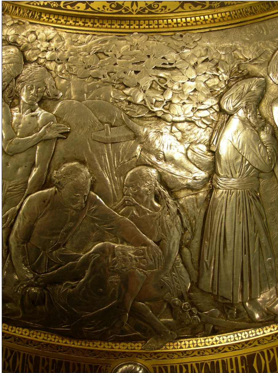
Fig. 36: Henry Hugh Armstead, The Civilization of the Bhils. Detail of Fig. 1.

The Bhils' attention is focused upon the pietà-like scene on the right. Indeed, in the sequencing of the first two panels, Armstead suggests an epochal shift from the 'primitive', animistic religion of the Bhils towards Christianity and the Italian Renaissance on the right. The pietà depicts Outram's 'great unselfishness' and 'fatherly kindness' towards a dying Bhil,