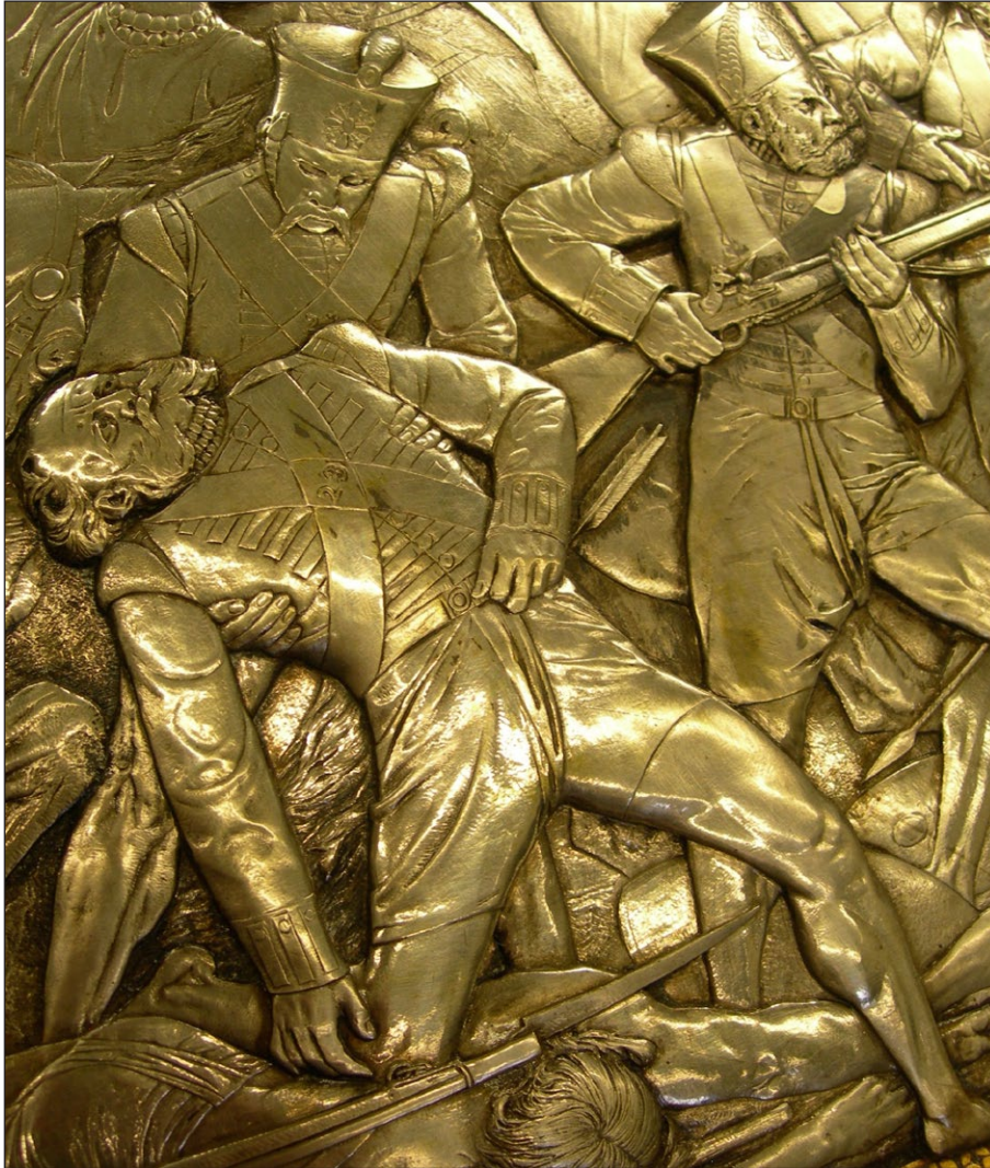
Fig. 33: Henry Hugh Armstead, The Subjugation of the Bhils. Detail of Fig. 1.

Armstead's second panel, The Civilization of the Bhils , focuses on this mission. Here, viewers see Bhil women and children being safely ushered, by a Bhil man, into the political fold ( Fig. 34 ). The man accompanying them raises his left hand to bless the merciful Outram, comforting a dying Bhil below ( Fig. 35 ). His gesture and physique signify the success of Outram's 'double work of morally civilizing and physically disciplining' the indigenous population (1, 59).