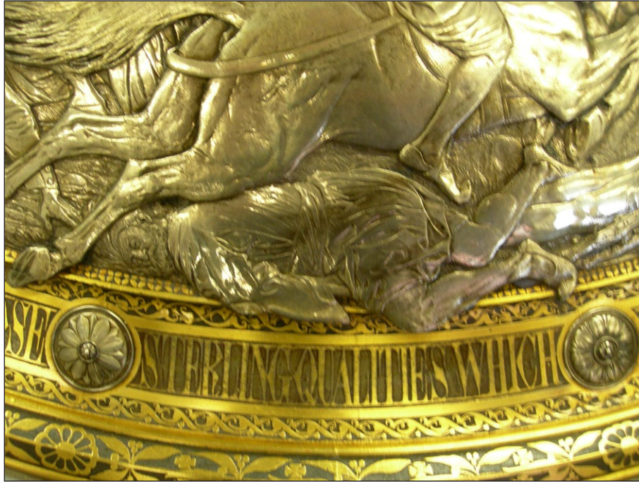
Fig. 58: Henry Hugh Armstead, The Bombay Cavalry . Detail of Fig. 1 .