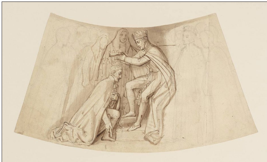
Fig. 15: Thomas Stothard, Study for the Wellington Shield: The Duke of Wellington Kneeling Before the Prince Regent, the Lord Chancellor and Other Figures Behind Them , date unknown, graphite, ink and watercolour on paper, 1554 mm × 290 mm. Tate Britain.