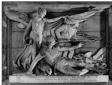
Fig. 61: Francis Chantrey, Monument to Major General Daniel Houghton , after 1811, marble, West aisle, North transept of St Paul's Cathedral, London, England.

Having defeated the Persians, in March 1857 Outram received a command, from Bombay, to march all available troops back to India. The march was highly challenging, the soldiers' boots dragged from their feet by mud, so that at least half of the 78th returned barefoot, requiring Outram to issue new boots and stockings to every soldier gratis (Goldsmid, II, 157).