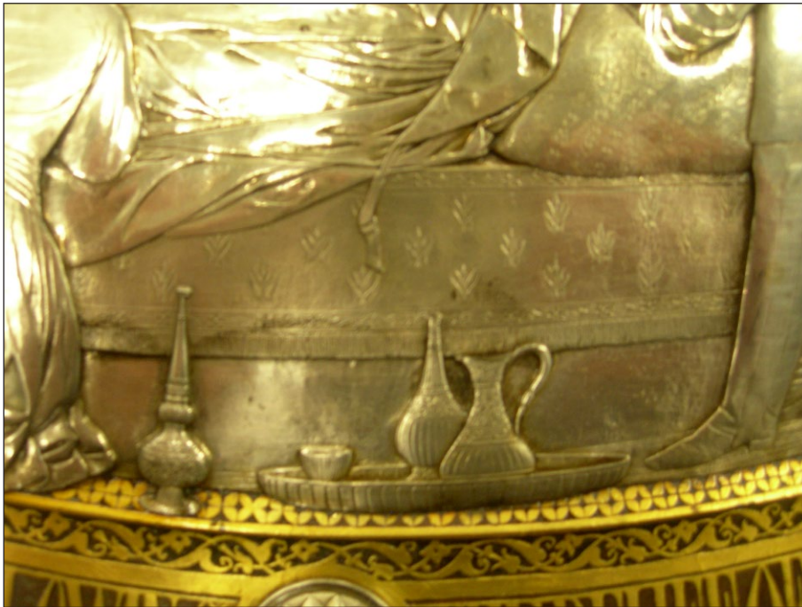
Fig. 17: Henry Hugh Armstead, The Death of the Chieftain. Detail of Fig. 1.

In addition, Armstead shared with his South Kensington patrons an interest in a material culture focusing on South Asia and the Islamic Middle East; and, with Jones, a passion for oriental textiles and patterns. Armstead includes three orientalist vessels, as well as a cup and a tray, at the bottom of the Death of the Chieftain panel (Fig. 17), and takes evident delight in the visual and tactile qualities of the patterned textile surface of the cushions; the patterned throw with its tassels (Fig. 18); the turbans of the Amirs on