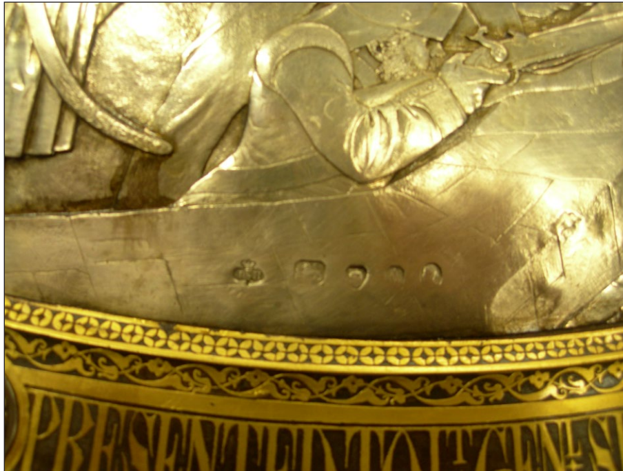
Fig. 55: Henry Hugh Armstead, The Defence of the Hyderabad Residency. Detail of Fig. 1.

In many ways, however, the relief again acts as a smokescreen. While the British fought together successfully against the Amirs, Outram and his fellow officers did not agree when it came to the Amirs' surrender. Outram had been against Sind's annexation, and was appalled at the treatment of the defeated Amirs. The British agreed to release Outram's 'especial protégé' (Goldsmid, 1, 327), but a bloody battle of words followed, regarding the other Amirs, that nearly wrecked Outram's career.