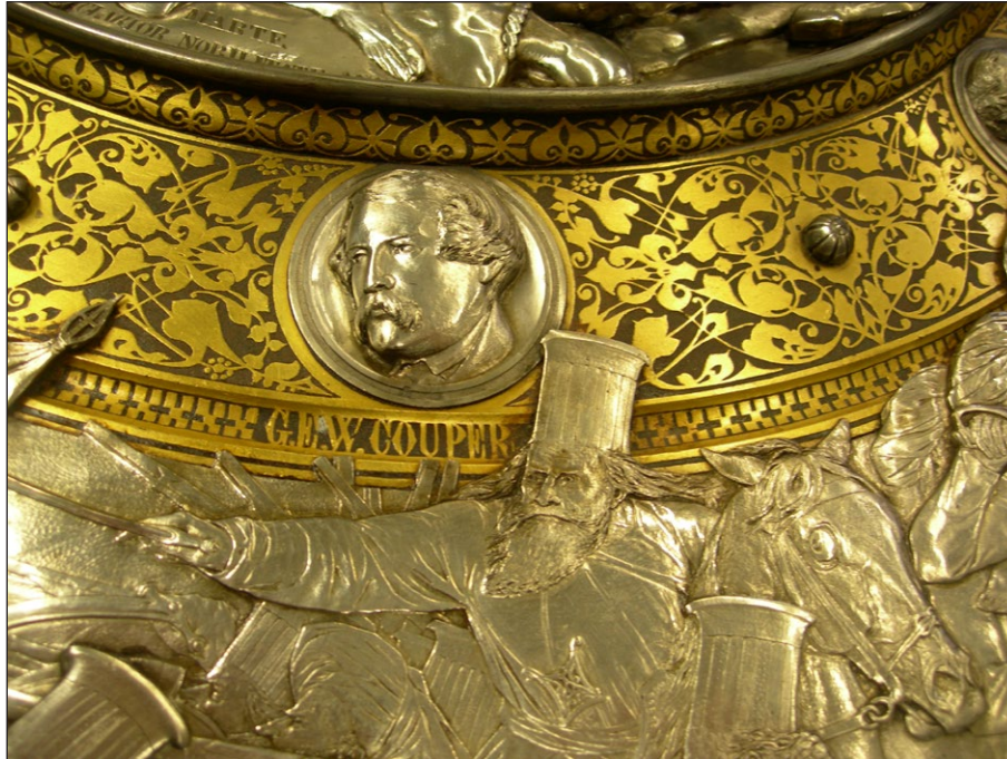
Fig. 40: Henry Hugh Armstead, The Defence of the Hyderabad Residency . Detail of Fig. 1.

employs to bridge the overlap of the next two scenes where, read from left to right, he is fighting against the British, but where, read right to left, he is fighting with the British (Fig. 40). The alarmed face of his horse, making eye contact with the viewer, signals its unhappy role in such duplicity. 42 Such figures reveal that Armstead was susceptible to the widespread perception of what Goldsmid calls the Amirs' 'treachery and underhand opposition' (II, 213); and what Outram referred to as the 'spirit of intrigue [. . .] inherent in oriental character' (Thomas, p. 93). They also suggest the necessity of Outram's lifelong campaign against Khatput or bribery and corruption in South Asia.