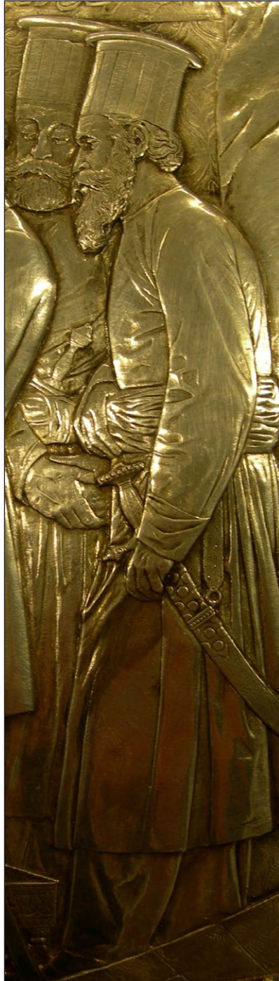
Fig. 23: Henry Hugh Armstead, The Death of the Chieftain . Detail of Fig. 1 .