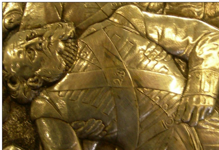
Fig. 54: Henry Hugh Armstead, The Defence of the Hyderabad Residency. Detail of Fig. 1. Photograph: Jason Edwards.