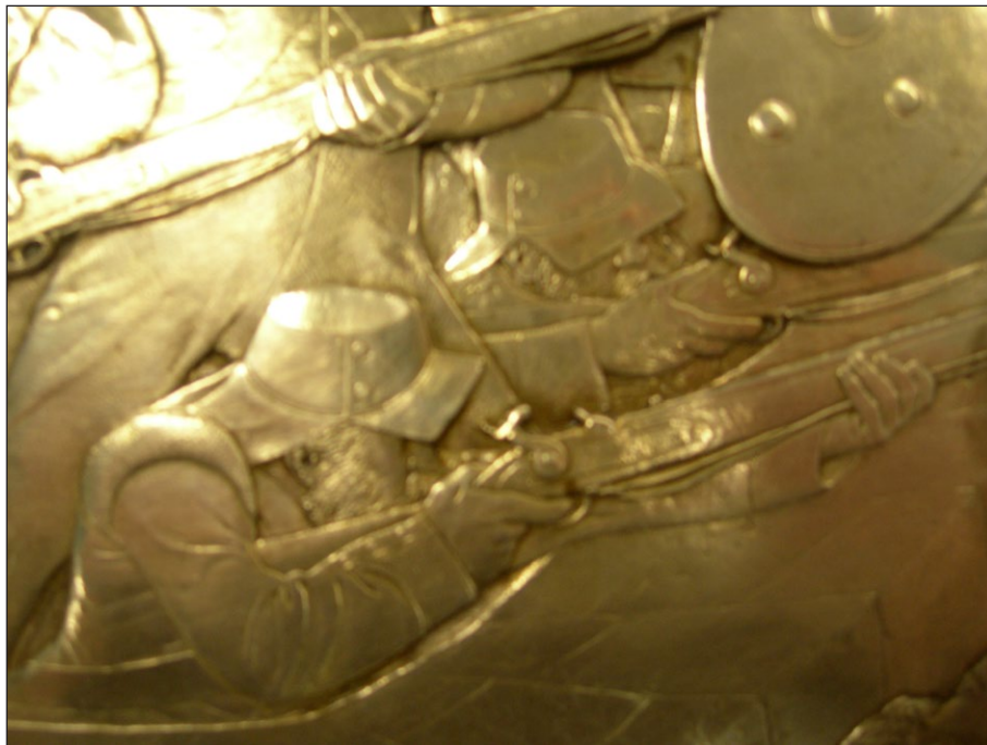
Fig. 51: Henry Hugh Armstead, The Defence of the Hyderabad Residency. Detail of Fig. 1.