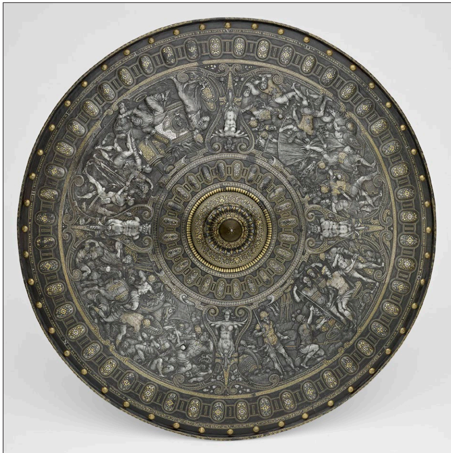
Fig. 11: Eliseus Libaerts, Parade Shield (' The Cellini Shield '), c. 1562–63, materials unstated, 58.4 cm × 19.1 cm, Royal Collections.