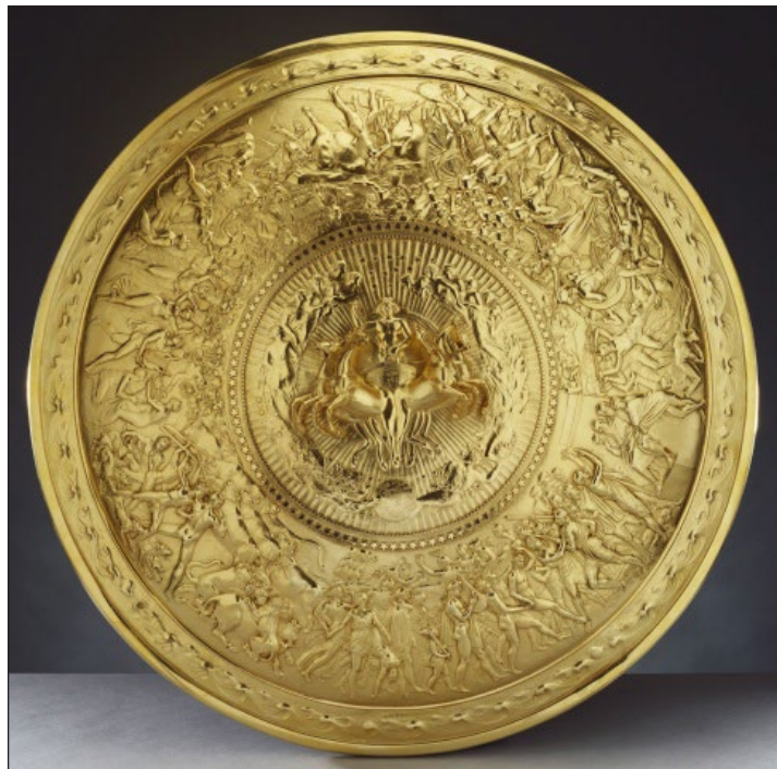
Fig. 8: John Flaxman, for Rundell, Bridge, and Rundell, The Shield of Achilles , 1821–23, gilt silver, 90.5 cm × 90.5 cm × 10 cm, Royal Collections.