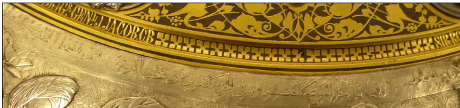
Fig. 25: Henry Hugh Armstead, The Death of the Chieftain . Detail of Fig. 1.

‘In the sky it is written on pages of desire: whosoever does that which is good will be rewarded in kind’; a kind of approximate Farsi equivalent of Outram’s Latin motto (Fig. 25). 25