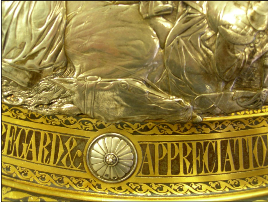
Fig. 60: Henry Hugh Armstead, The Bombay Cavalry . Detail of Fig. 1 .