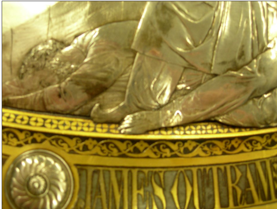
Fig. 48: Henry Hugh Armstead, The Defence of the Hyderabad Residency. Detail of Fig. 1.