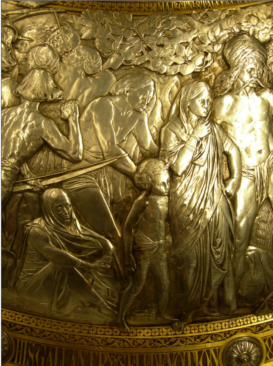
Fig. 34: Henry Hugh Armstead, The Civilization of the Bhils . Detail of Fig. 1.

libations of brandy'. Instead, Armstead depicts the subsequent stage in which Outram gained Bhil 'confidence by living unguarded among them' (Goldsmid, 1, 61). Armstead signifies the new civilization of this 'hitherto degraded race' as a kind of cultural Renaissance, as we have seen (1, 67). He focuses on the Bhils' turn to agriculture from hunter-gathering,