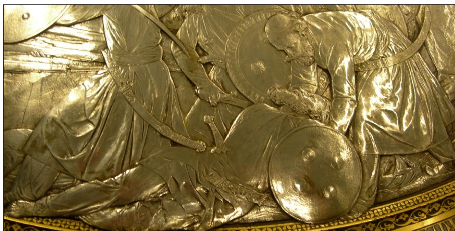
Fig. 49: Henry Hugh Armstead, The Defence of the Hyderabad Residency. Detail of Fig. 1.