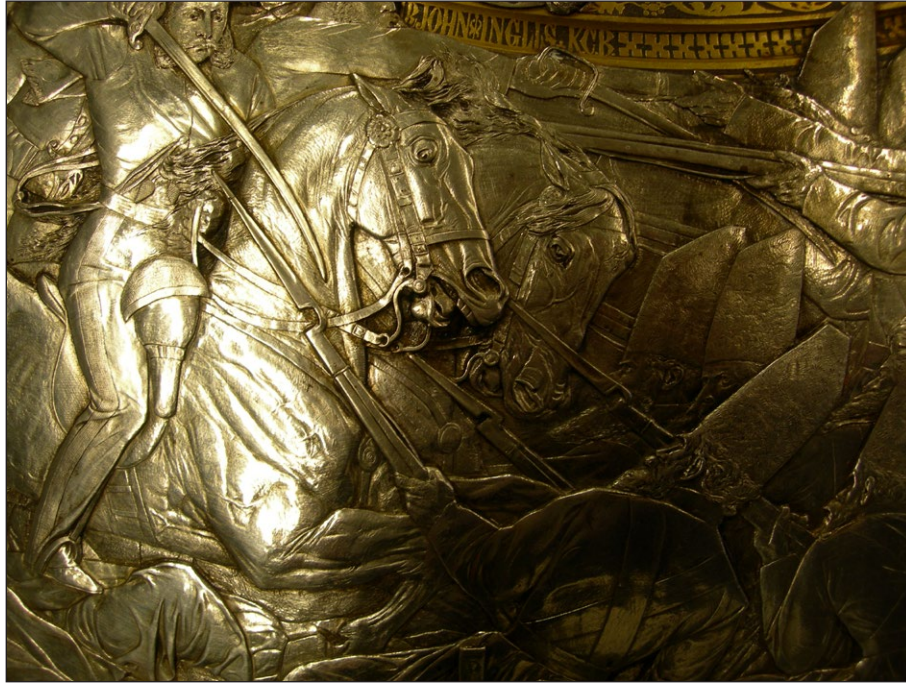
Fig. 6: Henry Hugh Armstead, The Charge of the Bombay Cavalry . Detail of Fig. 1.

the Bhils , suggesting that population's subjugation to the might of a British Empire, as great as the Roman (Fig. 7). 12 The overall idea of the elaborate shield itself, meanwhile, enters into a paragone with the Shield of Achilles described by Homer, and imaginatively reconstructed between 1821 and 1823 by John Flaxman (Fig. 8). 13