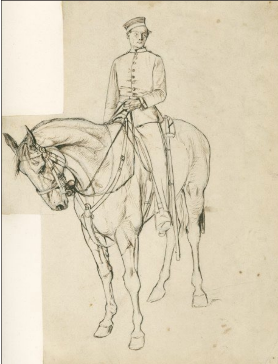
Fig. 64: Henry Hugh Armstead, Study of a Cavalryman for the Outram Shield , c. 1860, pen and ink over pencil on cream wove paper, 337 mm × 248 mm, Royal Academy of Arts, London.

A faceless, cowardly, turncoat cavalryman, meanwhile, trying to escape, leaps over a second dead rebel, lying face down. His hand reaches to his groin for comfort, while his right foot overlays the feet of the first of two dead Bhils in the subsequent panel, suggesting, in the overlapping,