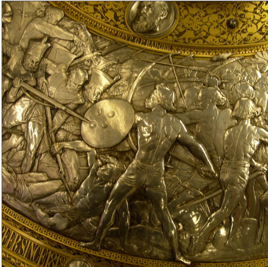
Fig. 27: Henry Hugh Armstead, The Subjugation of the Bhils . Detail of Fig. 1.

the native infantry, the Bhils are attired in gurji , but lack their civilizing pagri or turbans, and angrikha or vests. This has the complimentary effect of revealing their classical physiques, allowing Armstead to flaunt his academic sculptural credentials, in the comparatively decorative context of silverware. But if Armstead's Bhils possess the muscular torsos and limbs of antique sculpture, he denies them the status of full academic nudes by depicting hair under their arms and dressing them in their, to western eyes, infantilizing, nappy-like gurji . The bow and arrow-wielding Bhils might also bring to mind Homer's Teucer, but their simple shields are, as we have seen, no match for Armstead's and cannot defend them against the British. 38