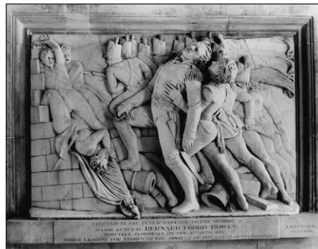
Fig. 57 : Francis Chantrey, Monument to Major General Bernard Bowes , c. 1814–22, marble, North transept of St Paul’s Cathedral, London, England.

Armstead’s battle scenes are increasingly violent and painful to view, towards the end of the shield’s narrative sequence. In addition to the two dead Persians whose bodies are trampled by horses, one face up, one face down ( Fig. 58 ), Armstead includes an Anglo-Arabian stallion, itself a model of successfully subordinated imperial hybridity, being bayoneted through its left nostril by rebels ( Fig. 59 ). Its ears are pinned back, its head rears up, its lips are retracted, and Armstead individualizes it down to the veins and straps on its face, the floral decoration below its right ear, and the individual hairs of its mane. The horse behind it, meanwhile, is being stabbed in its neck. Armstead’s empathetic attention to horse anatomy and equine experience recalls George Stubbs, as well as Cotterill, and represents evidence of Armstead’s emphatically English art-historical and sympathetic cultural credentials. 56 In the subsequent scene, meanwhile, Armstead includes a dead horse, with a lolling tongue, lifted from Chantrey’s Houghton memorial ( Figs. 60, 61 ).