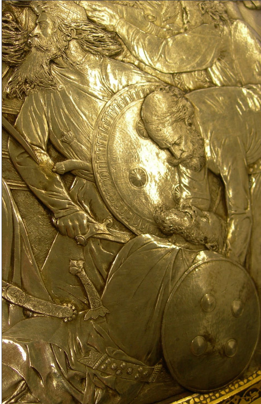
Fig. 22: Henry Hugh Armstead, The Defence of the Hyderabad Residency. Detail of Fig. 1.