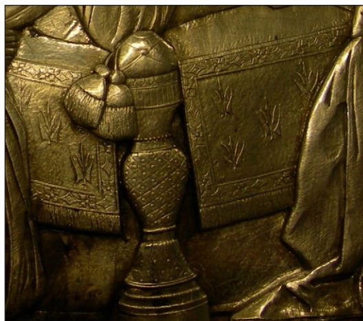
Fig. 18: Henry Hugh Armstead, The Death of the Chieftain . Detail of Fig. 1.