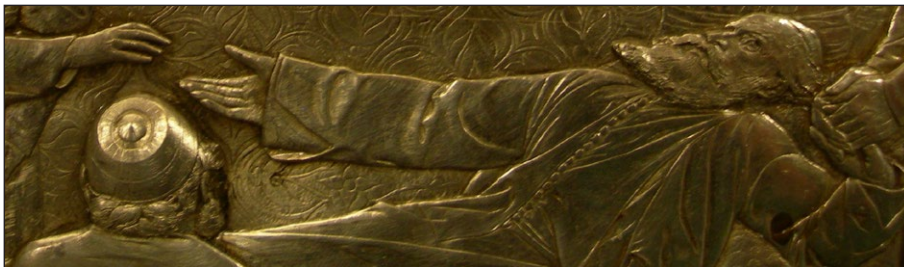
Fig. 45: Henry Hugh Armstead, The Death of the Chieftain . Detail of Fig. 1.

‘needlessly suspicious of aggressive intent in the minds of foreign Powers’, providing sculptural evidence of the ‘suspiciousness of foreign intriguers’ (Goldsmid, II, 351). Armstead also emphasized Outram’s skills as a diplomat, challenging his sustained reputation for tactlessness, especially in relation to his British superiors.