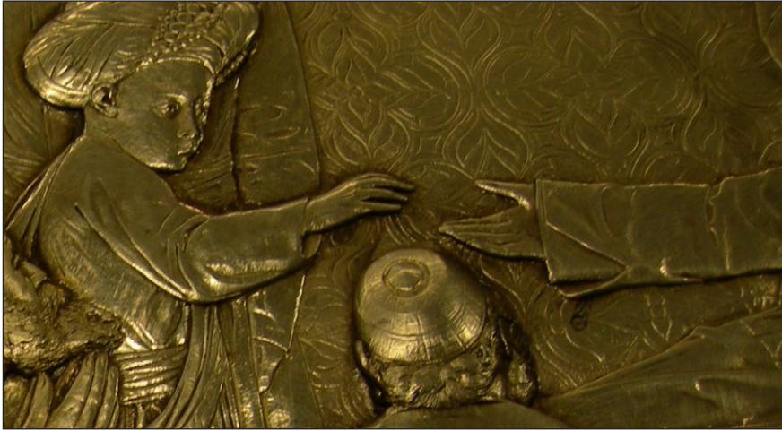
Fig. 10: Henry Hugh Armstead, The Death of the Chieftain . Detail of Fig. 1.