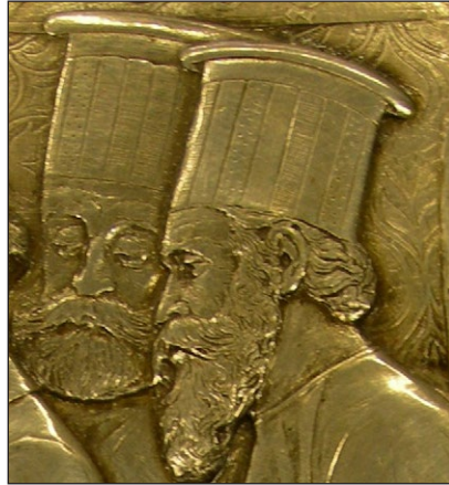
Fig. 20: Henry Hugh Armstead, The Death of the Chieftain . Detail of Fig. 1.