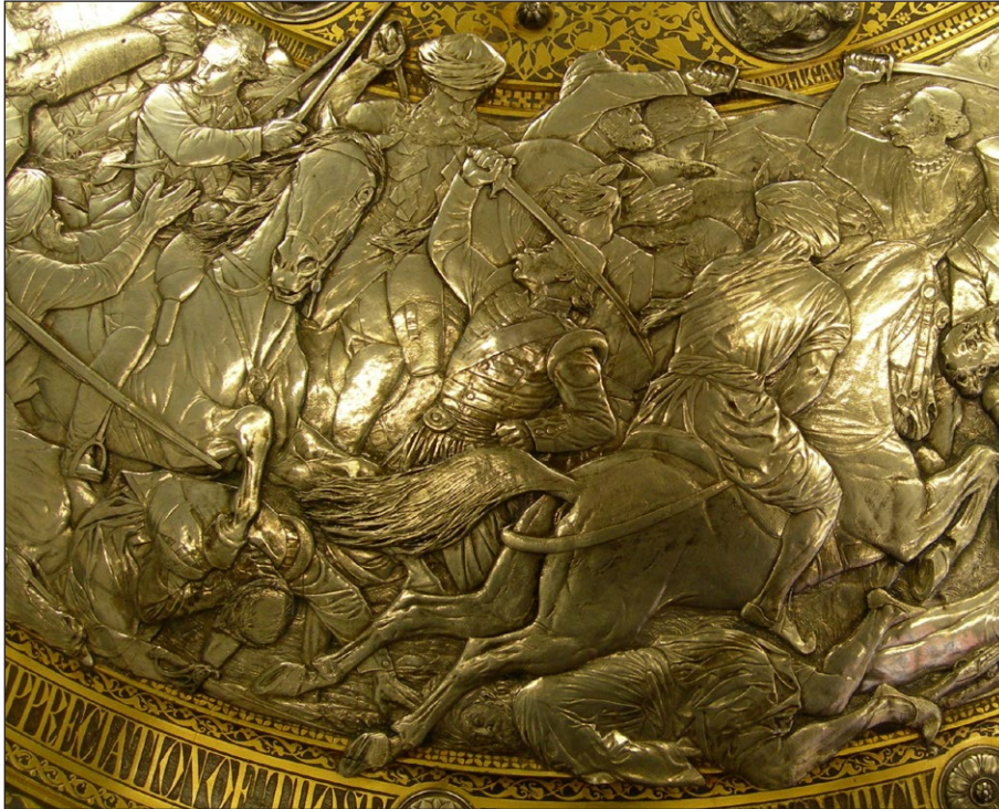
Fig. 65: Henry Hugh Armstead, The Charge of the Volunteer Cavalry Before Lucknow . Detail of Fig. 1.

circular form of the shield, a never-ending imperial narrative of subjugation, civilization, rebellion, and reterritorialization.