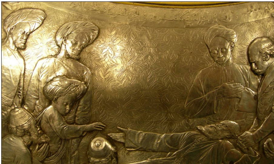
Fig. 21: Henry Hugh Armstead, The Death of the Chieftain. Detail of Fig. 1.

Mutiny. 22 For example, on visiting the Great Exhibition, Matthew Digby Wyatt commented on how ‘startled’ the British had been when they ‘found that in consistency of design’ those they had been ‘too apt to regard as almost savages’ were infinitely their ‘superiors’. 23 In order to counteract