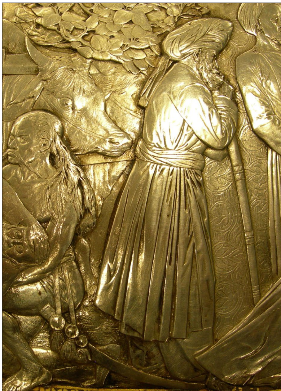
Fig. 41: Henry Hugh Armstead, The Death of the Chieftain . Detail of Fig. 1 .