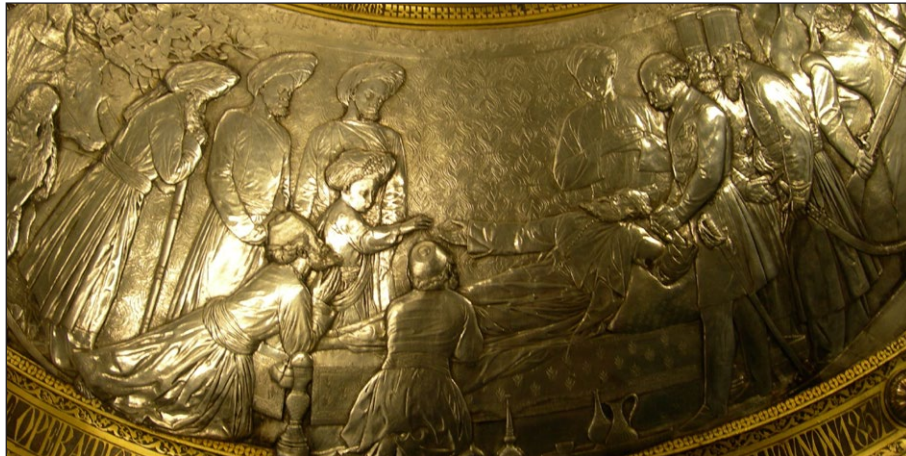
Fig. 38: Henry Hugh Armstead, The Death of the Chieftain. Detail of Fig. 1.

rise, hailing Outram as his brother, and putting his arms around him. ‘I laid him quietly down’, Outram recalled, ‘feeble and emaciated’, but the Amir beckoned to his bedside his brother, Nasir Khan, seen immediately behind the dying Amir with his hands cupped across his heart, and the Amir’s youngest son, Hussain Ali, stretching out his right hand to take his father’s extended left. Crucially, Armstead focuses on the latter, rather than the former, raising into the foreground Hussain Ali, who would become Outram’s ward; and sinking into the background Nasir Khan, who would subsequently betray Outram. Originally taking the hands of his son and brother, however, the Amir placed them in Outram’s, saying, ‘You are their father and brother, you will protect them.’ Outram replied in ‘general but warm terms of personal friendship’, adding that he ‘trusted his Highness would long live to guide and support them’. ‘From the days of Adam’, the Amir continued, drawing, diplomatically, on the shared Old Testament heritage of Islam and Christianity, ‘no one has known so great truth and friendship as I have found in you.’ The Amir then took ‘some medicine’ from Outram’s hand (II, 219).