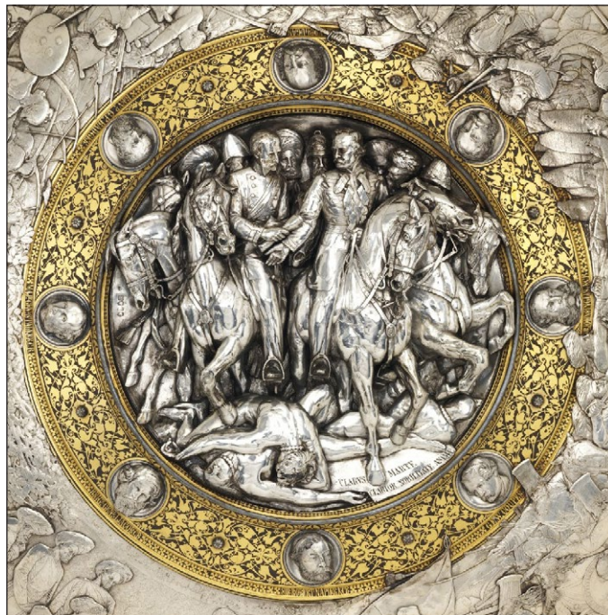
Fig. 62 : Henry Hugh Armstead, Roundel. Detail of Fig. 1 .

Armstead depicts a battle-weary Havelock nodding respectfully to Outram, accepting the papers of command from the open-handed general. After this, Outram told Havelock that 'I shall accompany you only in my civil capacity as Commissioner, placing my military services at your disposal, should you please to make use of me — serving under you as volunteer' (Goldsmid, II, 207). For contemporaries, the meaning of the scene was apparently self-evident. Indeed, Goldsmid suggests that his account would have been 'written in vain if this most honourable act require[d]