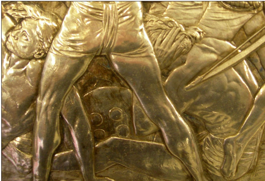
Fig. 31: Henry Hugh Armstead, The Subjugation of the Bhils . Detail of Fig. 1 .