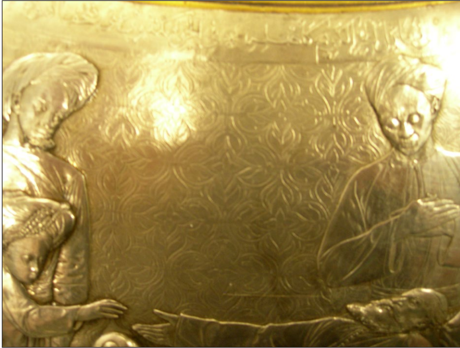
Fig. 44: Henry Hugh Armstead, The Death of the Chieftain . Detail of Fig. 1.