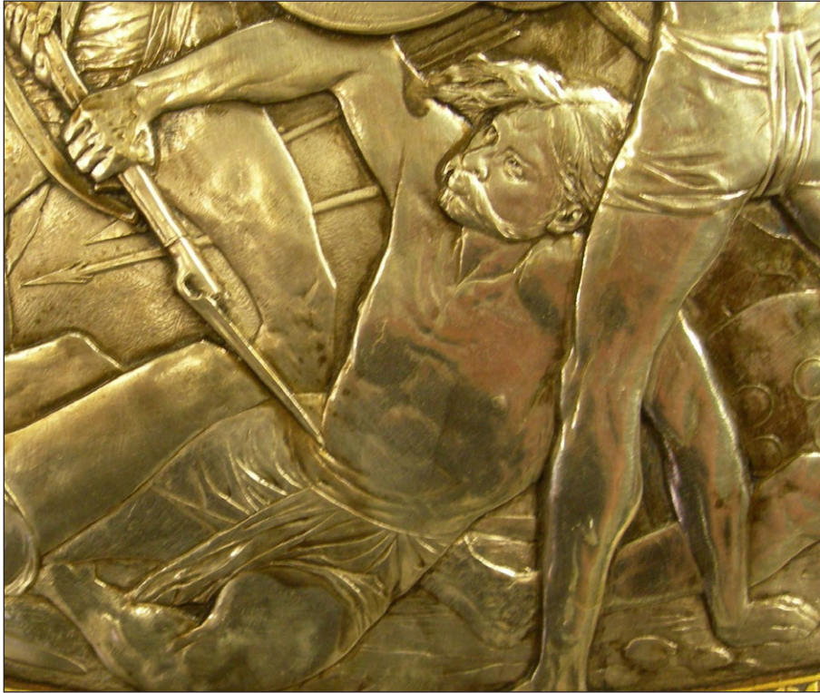
Fig. 30: Henry Hugh Armstead, The Subjugation of the Bhils . Detail of Fig. 1 .