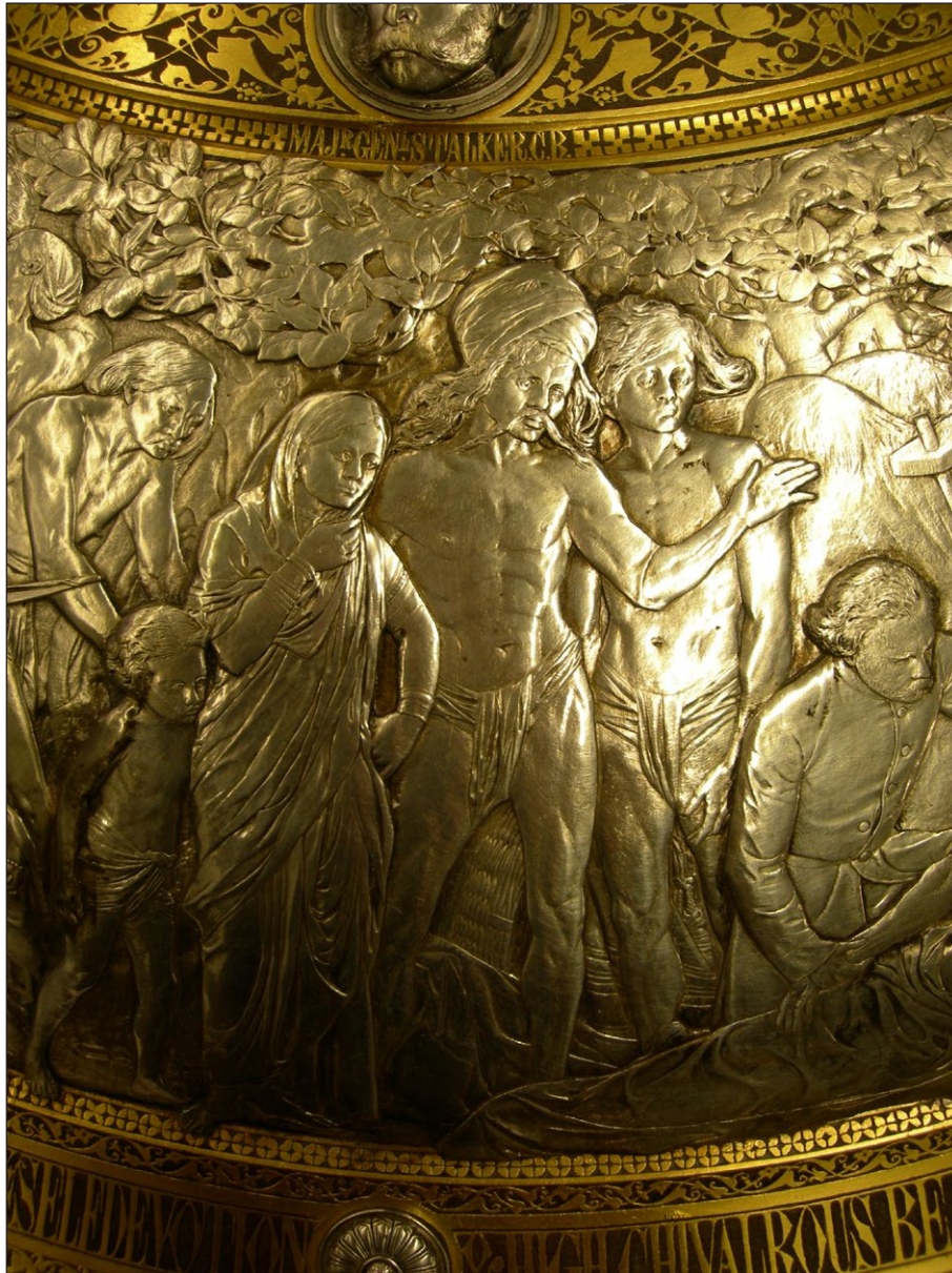
Fig. 35: Henry Hugh Armstead, The Civilization of the Bhils . Detail of Fig. 1.

through the presence of foliage that recalls the Della Robbias, and of an ox in harness (Fig. 36). This suggests the move from sword to plough, and the newly civilized status of the productively yoked, animal-like Bhils, the majority of whom Armstead now depicts face on, rather than in more demeaning profile.