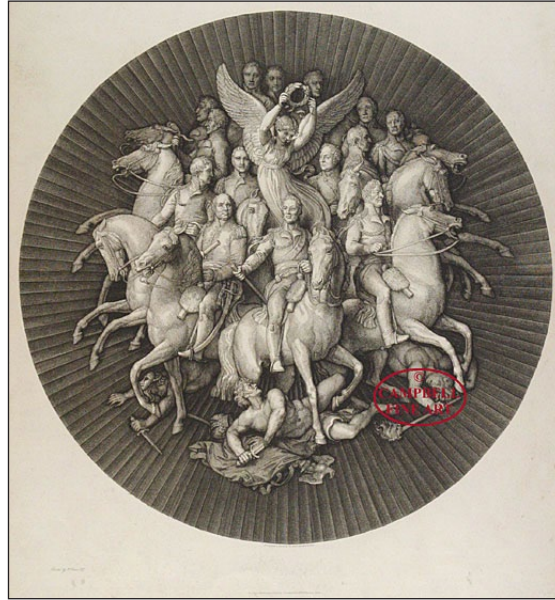
Fig. 14: Anon., after Thomas Stothard, Study for the Wellington Shield: The Roundel , 1820, 575 mm × 710 mm. Private Collection.