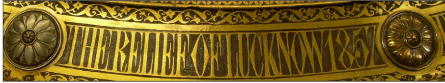
Fig. 3: Henry Hugh Armstead, 'Gothic Text'. Detail of Fig. 1.