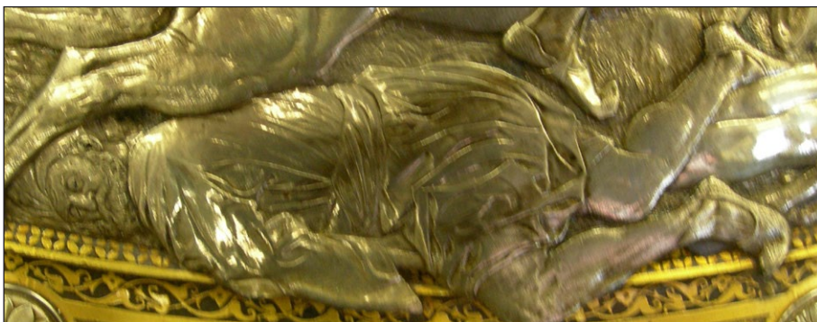
Fig. 29: Henry Hugh Armstead, The Subjugation of the Bhils . Detail of Fig. 1 .