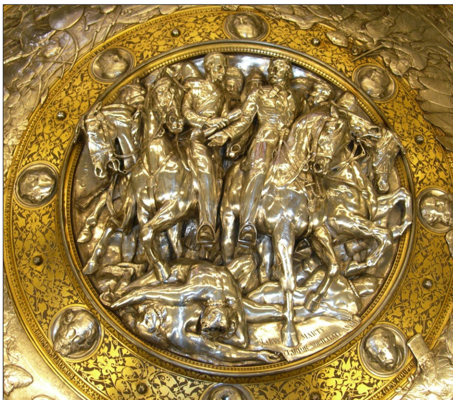
Fig. 16: Henry Hugh Armstead, Roundel. Detail of Fig. 1.

Armstead's sustained interest in equine anatomy, meanwhile, brought him into close relation with Edmund Cotterill, the former head designer for rival silversmiths Garrard's, who had died in 1860, while Armstead was working on the shield (Fig. 6). The Illustrated London News had praised Cotterill for being 'specially successful' in depicting 'living and dead' horses, noting how viewers could differentiate Andalusian and Flemish breeds because of Cotterill's 'masterly' articulation of every 'tendon, nerve and muscle'. 20 Later-century contemporaries, such as Edmund Gosse, meanwhile, suggested that Armstead's realism was closely related to Pre-Raphaelitism. 21