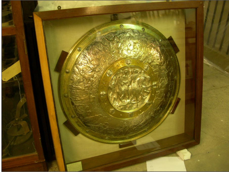
Fig. 2: Franchi and Son, after Henry Hugh Armstead, The Outram Shield , 1868, electrotype of electroformed copper, electroplated and oxidized, and partly electrogilded, 37 in. diameter, Victoria and Albert Museum.

sculpted ornament and figuration ranging from India and Persia, ancient Greece and Rome, medieval Europe and Renaissance Italy, and early nineteenth-century Britain. Indeed, in many ways, Armstead's stylistically eclectic shield represented a kind of three-dimensional parallel to Owen Jones's Grammar of Ornament (1857), published a year before the shield was commissioned, with Armstead's floriated bosses closely resembling examples of Assyrian ornament in Jones's text ( Figs. 3, 4 ). 9 For example, the shield's overall, multi-circumference form, elaborated with both bosses and damascening, are inspired by Persian and Indian precedents ( Fig. 5 ). 10 Armstead alludes to Phidias's Parthenon reliefs in his Anglo-Indian cavalry figures, thus aligning the British with the fifth-century Athenians ( Fig. 6 ); 11 and the sculptor recalls the Dying Gaul in his depiction of the Subjugation of