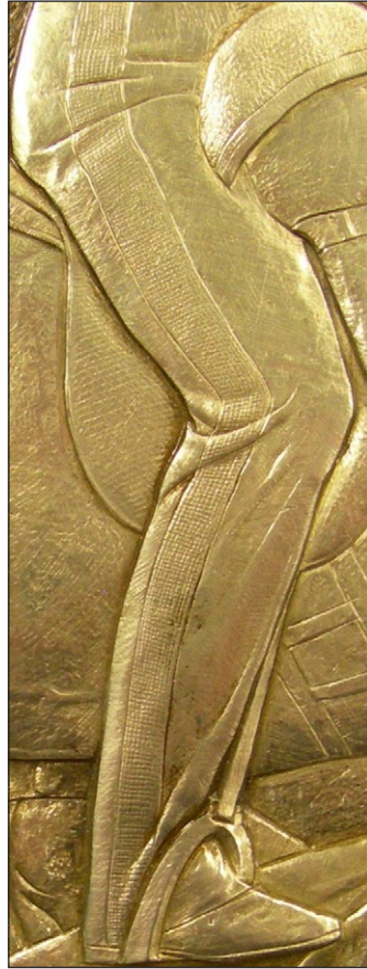
Fig. 53: Henry Hugh Armstead, The Defence of the Hyderabad Residency. Detail of Fig. 1.