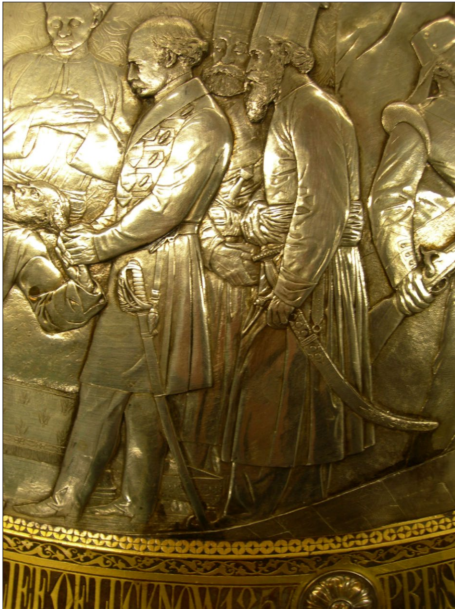
Fig. 39 : Henry Hugh Armstead, The Death of the Chieftain . Detail of Fig. 1 .

hands behind Outram's back. These take advantage of the moment, to make a secret side treaty ( Fig. 39 ). The figure on the right's sword curves up into the adjacent clockwise scene. As such, it poses a threat to those defending the Hyderabad Residency. It acts as a reminder that it was just such Amirs who would rebel against the British. The Persian man also resembles and anticipates a second pivotal, mounted figure that Armstead