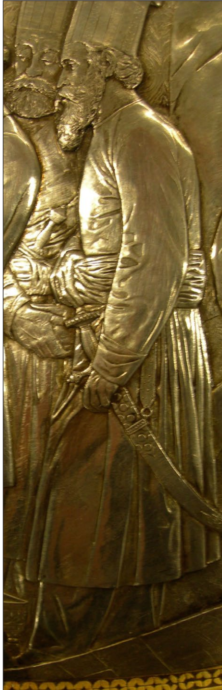
Fig. 43: Henry Hugh Armstead, The Death of the Chieftain . Detail of Fig. 1 .