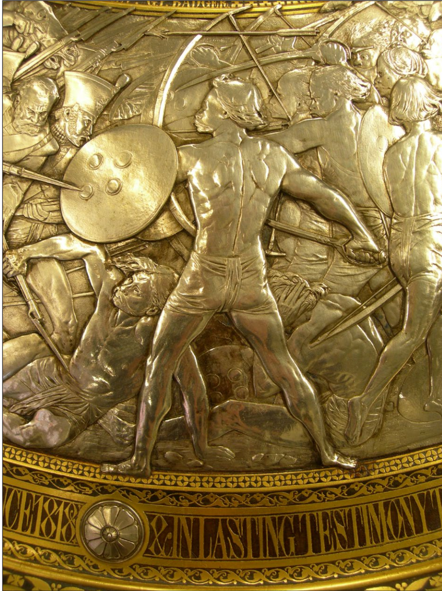
Fig. 26: Henry Hugh Armstead, The Subjugation of the Bhils. Detail of Fig. 1.

soldiers, in the heat of battle, under the command of Outram, mounted behind them ( Fig. 27 ). Each wear Raj uniforms above their waists, and gurgi below, a 'kind of knee breeches, made double and of strong cloth' (Goldsmid, 1, 389). The bipolar costumes of this hybrid force emblemize British restraint and superiority, above, and Bhil inferiority, below. Like