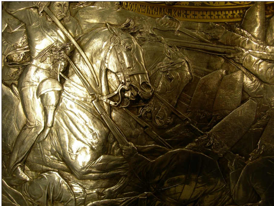
Fig. 59: Henry Hugh Armstead, The Bombay Cavalry . Detail of Fig. 1 .