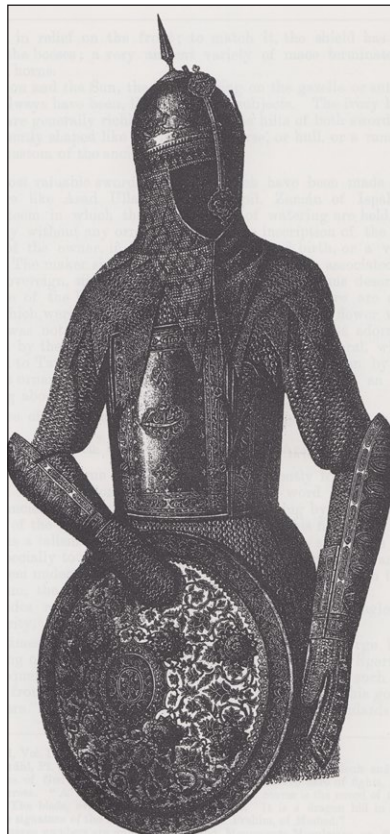
Fig. 5: W. Griggs, Persian Armour: Early Part of 18th Century (Zarkoe Selo Collection), Plate V of Lord Egerton of Tatton, Indian and Oriental Arms and Armour (London: Allen, 1896; repr. New York: Dover, 2002). Collection of Jason Edwards. Photograph: Jason Edwards.