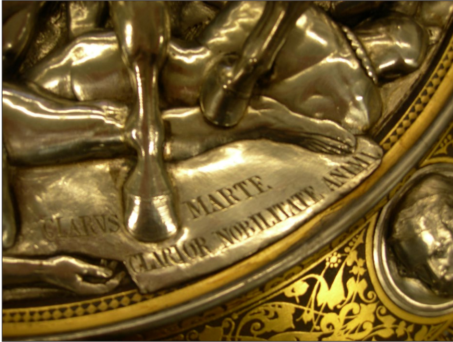
Fig. 24: Henry Hugh Armstead, Roundel. Detail of Fig. 1.