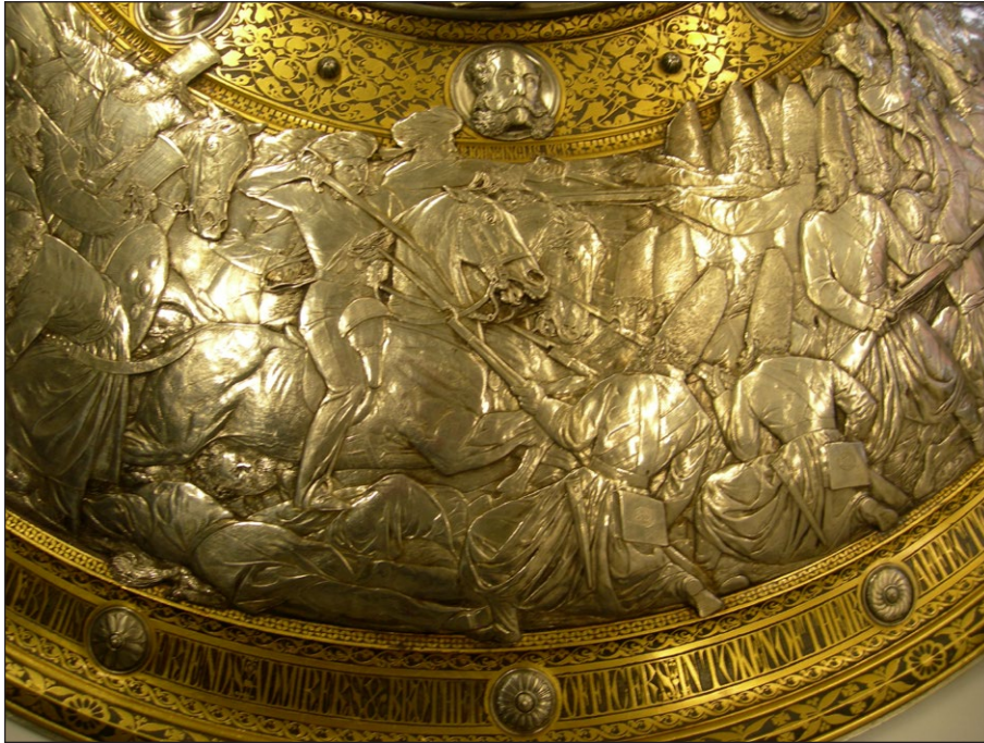
Fig. 56: Henry Hugh Armstead, The Bombay Cavalry . Detail of Fig. 1.

They fight eleven Persian infantry rebels, in distinctive, five-sided hats, which face in both directions, to suggest the Iranian enemy's lack of military discipline and turncoat character.