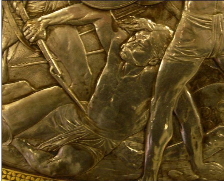
Fig. 7: Henry Hugh Armstead, The Subjugation of the Bhils . Detail of Fig. 1 . Photograph: Jason Edwards.