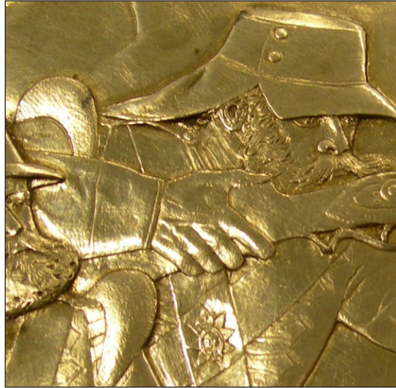
Fig. 50: Henry Hugh Armstead, The Defence of the Hyderabad Residency. Detail of Fig. 1.