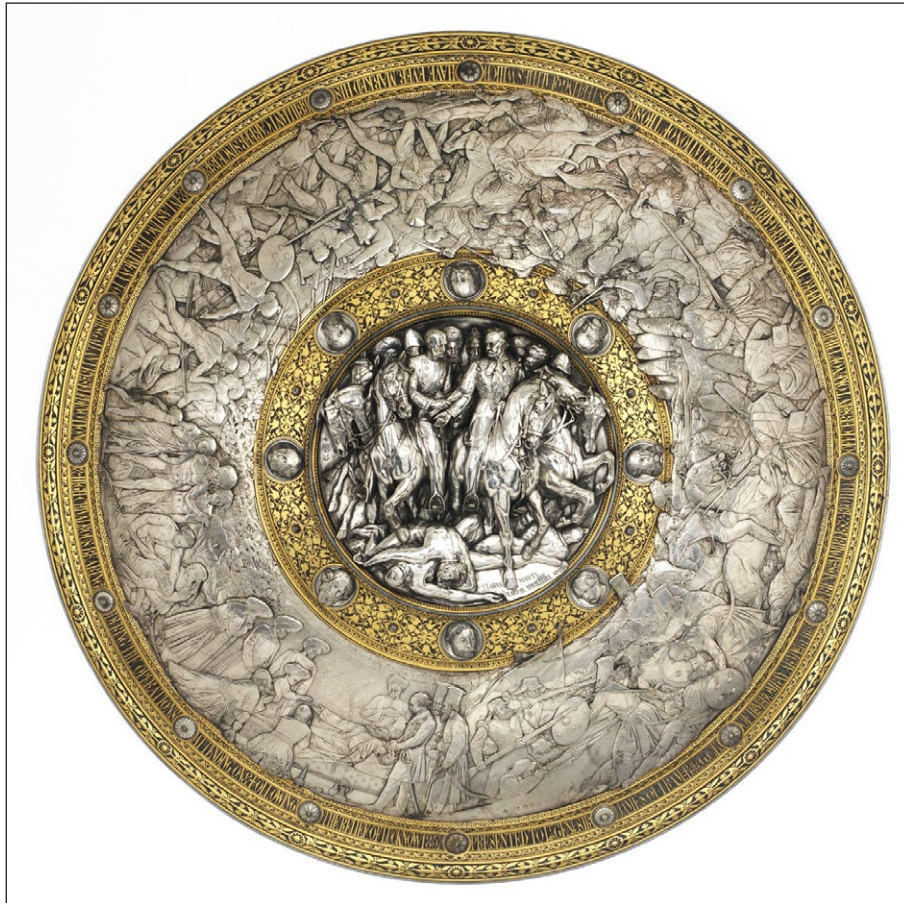
Fig. 1: Henry Hugh Armstead, for Hunt & Roskell, The Outram Shield, c. 1858–62, gold and silver damascened steel, 37 in. diameter, on loan to the Victoria and Albert Museum.

The shield was subsequently shown at the International Exhibition in 1862, where it won Hunt & Roskell a medal. 3 In 1864, the family loaned the shield to the South Kensington Museum (now the V&A), where it has largely remained to this day, becoming a central feature, from 2002, of the silver galleries. The shield did, however, earlier travel to the Paris