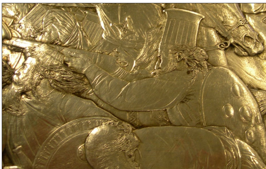
Fig. 52 : Henry Hugh Armstead, The Defence of the Hyderabad Residency . Detail of Fig. 1 .

To maximize the persuasiveness of his realism, Armstead sourced and paid considerable attention to the detail of military costumes. He picks out, across the three overlapping battle scenes that form the second half of the shield's narrative, sleeve and hat buttons, shoulder pads, brocaded stripes, 'VR' and 23rd regiment breastplates on people and horses, and the etched textures of the 23rd regiment hats (see, for example, Figs. 53, 54 ). In The Defence of Hyderabad , however, his anonymous,