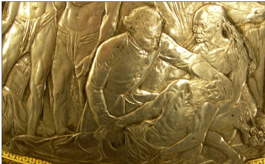
Fig. 37: Henry Hugh Armstead, The Civilization of the Bhils. Detail of Fig. 1.

An apparent model of cultural sensitivity, Outram did not, however, depart until he had ‘bent over the dying chief to catch his last farewell’. This is the poignant scene Armstead depicts, with Outram tenderly, but firmly, taking Khundoo’s right wrist, as if taking his pulse, and placing his left hand on Khundoo’s brow, as if to feel his temperature ( Fig. 37 ). The sculptor does not depict what happened next, when Khundoo ‘took the hand of his little son, and placing it in Outram’s, bid him supply a father’s place to him’ (Goldsmid, 1, 102). Armstead, as we shall see, saves a similar ‘adoption’ for the subsequent scene. But both allegorize the willing handover, by natives, of inherited Indian territory