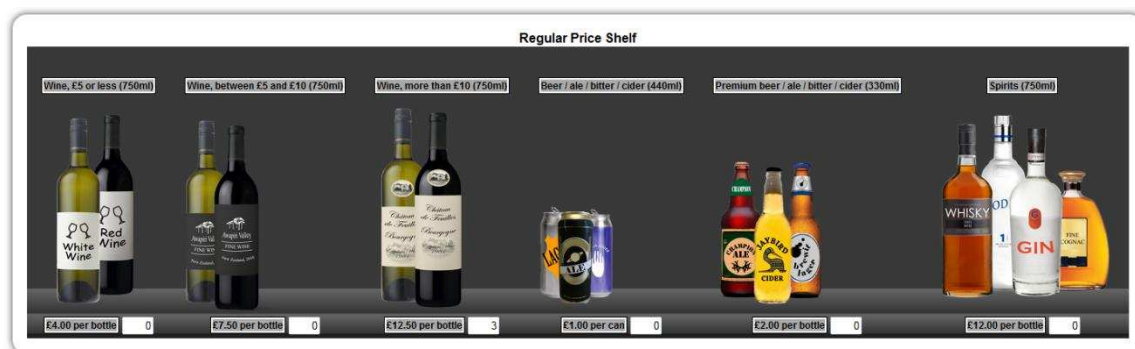
Figure 1 Example choice scenario without multi-buy promotions

The presentation of the choices drew on the visual presentation of two supermarket shelves. On one shelf were the six types of non-promotion alcohol products. Respondents were asked to indicate how many bottles or cans of each alcohol type they would purchase at that price. The total price for all choices they made was shown on the screen which is updated immediately after any adjustments to the choices made. Figure 1 illustrates an example choice scenario without promotions.