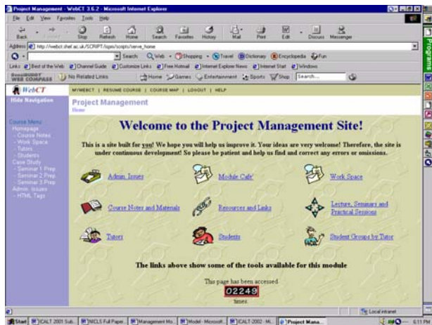
Figure 2. The ISPM Environment.

Evaluation is the collection, analysis and interpretation of information about any aspect of a programme of education and training, as part of a recognised process of judging its effectiveness, its efficiency and any other outcomes it may have [15]. Evaluation should not be