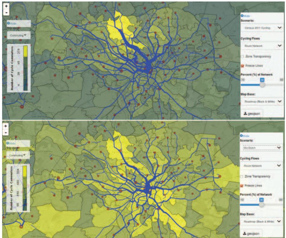
Figure 2: Comparison of cycling flows between the 2011 baseline scenario (above) and the Go Dutch scenario (below)