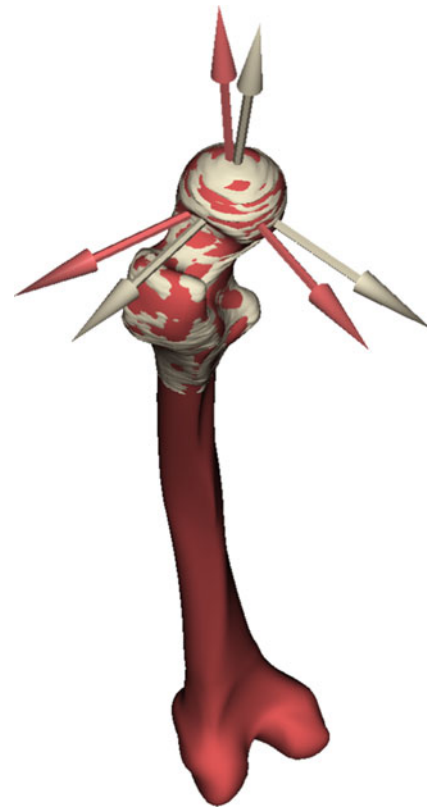
Fig. 1 Variation in femoral reference systems representing the neutral stance position. Reference system in brown colour is generated by employing anatomical landmarks in the proximal femur while the one in red colour is based on the anatomical landmarks in the estimated full femur (Color figure online)

In total, four FE models were developed for each patient to investigate the role of meshing technique and femur orientation method in determining hip fracture risk: model I :