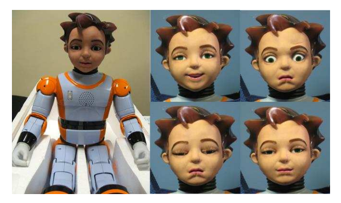
Figure 1. The Hanson Robokind Zeno R50 Robot with example facial expressions

In the current study the primary manipulation was to turn on or off the presence of appropriate positive and negative facial expressions during a game-playing interaction, with other features such as the nature and duration of the game, and the robot's bodily and verbal expression held constant. As our platform we employed a Hanson Robokind Zeno R50 [21] which has a realistic silicon rubber ("flubber") face, that can be reconfigured, by multiple concealed motors, to display a range of reasonably life-like facial expressions in real-time (Figure 1).