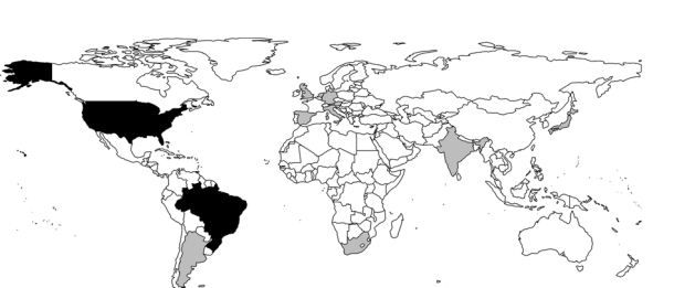
0 2 6 14 Fig. 2. Map of urban odonate peer-reviewed publications found per country.