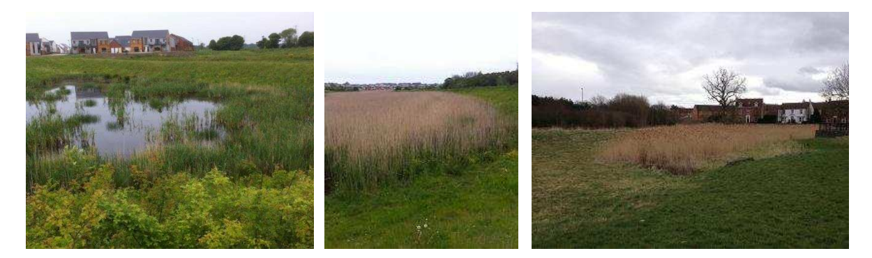
Figure 2 SuDS/BGI in Newcastle

The Newcastle LAA (www.bluegreencities.ac.uk/bluegreencities/research/learning-and-actionalliance.aspx) was established in February 2014 and regularly meets to discuss strategies to promote the Blue-Green Vision and encourage uptake. LAAs are open arrangements where participants with a shared interest in innovation and implementing change create a joint understanding of a problem and its possible solutions based on rational criticism and discussion (Ashley et al., 2012; Lawson and Lamond, 2014). LAAs encourage cooperation between a diverse range of stakeholders from different disciplines and backgrounds. In Newcastle, this includes members of the local authority, major landowners, water companies, academia and environmental groups, and represents a novel approach to facilitate the negotiation of a Blue-Green Vision. Such collaborative working between a group of individuals or organisations aligns with recommendations in the Floods and Water Management Act 2010 and Surface Water Management Plan (Defra, 2010). The aim of the LAA is for stakeholders to bring their knowledge and expertise and talk freely outside the constraints of existing formal institutional settings, challenge restrictive regulations and explore novel solutions. The LAA provides an effective way of integrating academic research with the needs of key stakeholders, practitioners and end-users.