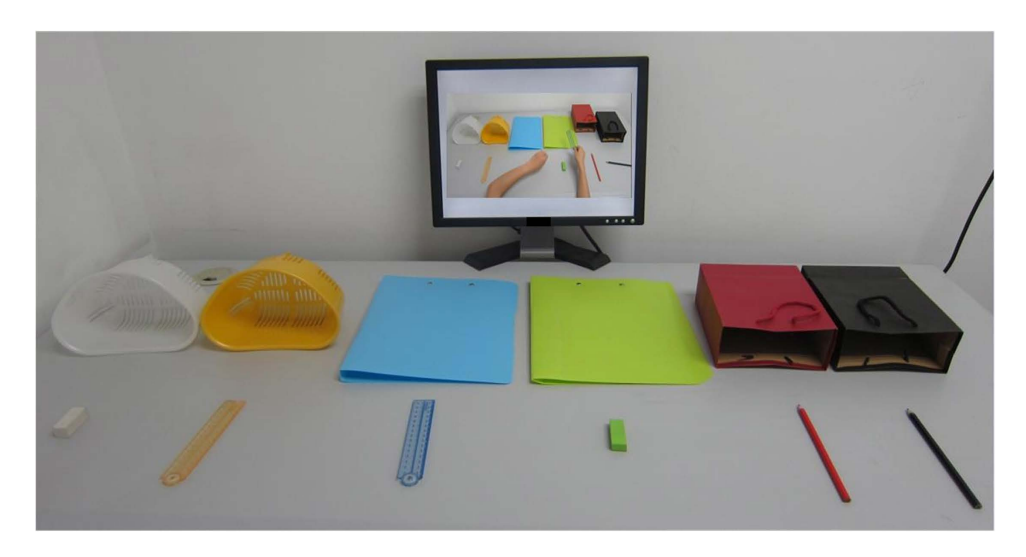
Figure 3. Illustration of task set-up during the demonstration condition.