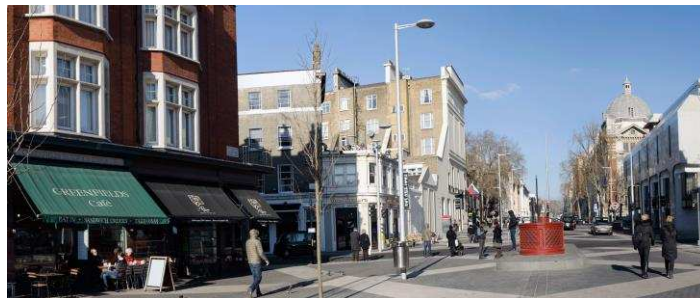
Figure 2 - Shared space, Exhibition Road, Kensington

Shared space projects are approaches to managing roadspace in a way that supports ease of movement and use for all road users by removing physical infrastructure and instead directing traffic through the use of paint and other more 'persuasive' techniques. DfT defines shared space as 'A street or place designed to improve pedestrian movement and comfort by reducing the dominance of motor vehicles and enabling all users to share the space rather than follow the clearly defined rules implied by more conventional designs' Department for Transport [28].