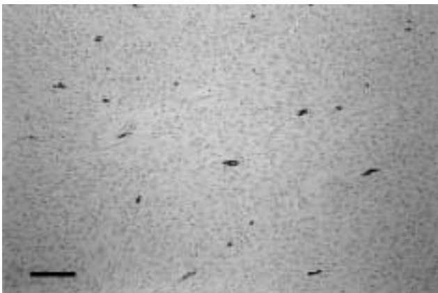
Figure 2 Photomicrograph of a tumour section with a low microvessel density ( \times 200 , bar = 50 \mu\text{m} )