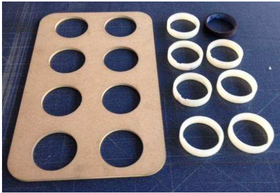
FIGURE 1 SPHERICAL SUBTEST SETUP

The Cylinder subtest uses the same 8 circular bases with 8 attachable plastic cylinder-shaped handles. The plastic cylinders are 80mm tall and 40mm in diameter (Figure 2-B). The Spherical subtest's objects consist of the circular bases without any attachable handle.