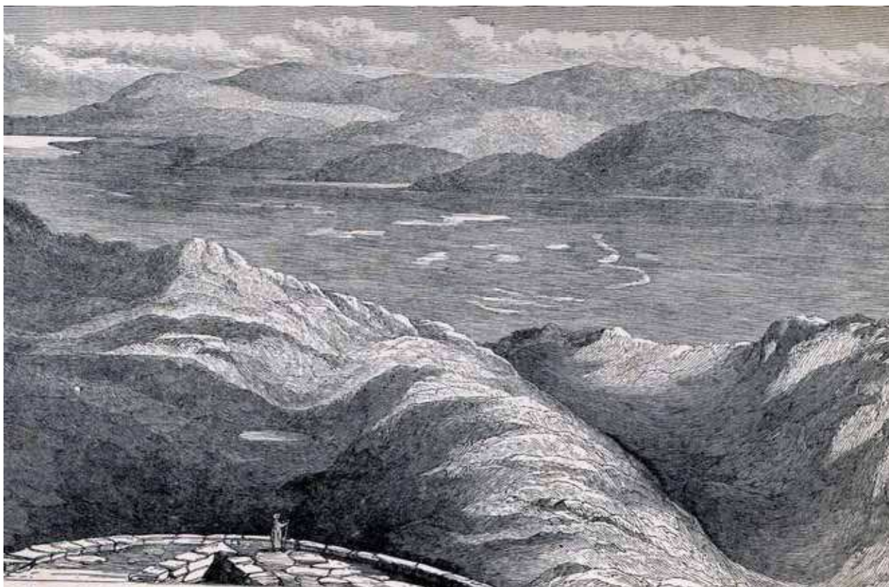
Figure 2. A mid-19 th century view of the Hula peatland from the north; ‘Hooleh Morass, from the Castle of Subeibeh’ (now generally known as Nimrod Fortress) from MacGregor (1869).

The pre-drainage Hula wetland was a human-modified landscape. If contemporary conservation management aims to reproduce habitats which mimic those of the original wetlands to even a small extent, then historical activities should be taken into account when setting restoration targets and deriving management approaches. This article adopts an environmental history approach to investigate and reconstruct the ways by which the local people exploited and managed the wetlands prior to drainage. A large corpus of historical records from travellers to the Hula has been studied, along with the scientific literature, in order to identify mechanisms and processes of human impact.