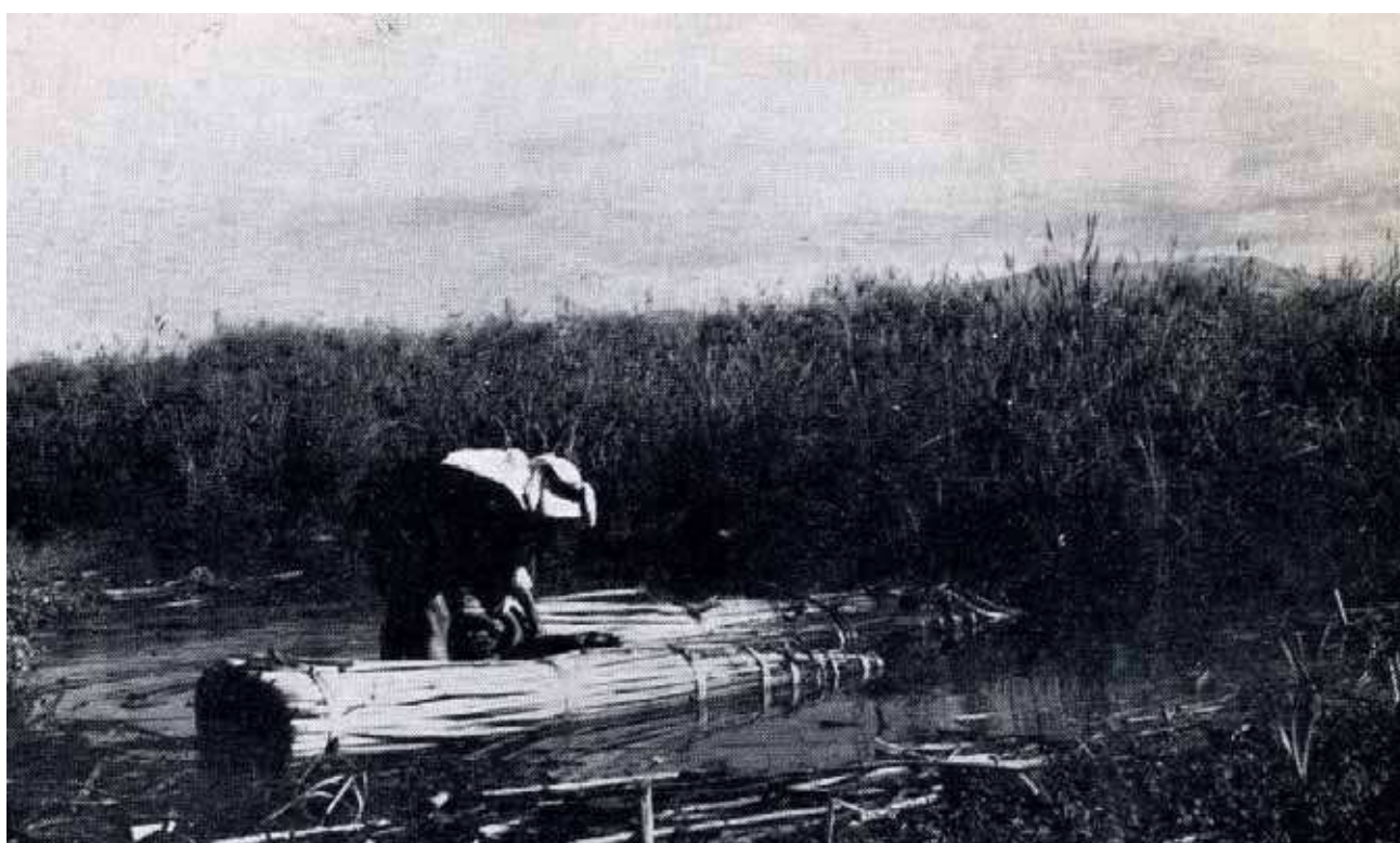
Figure 3. Early 20 th Century papyrus harvesting in the peatland, from Washbourn (1935). Above: ‘Part of Papyrus swamp (“dry area”)’; below: ‘Edge of Papyrus swamp preparing the “rafts” for the use of the expedition’.