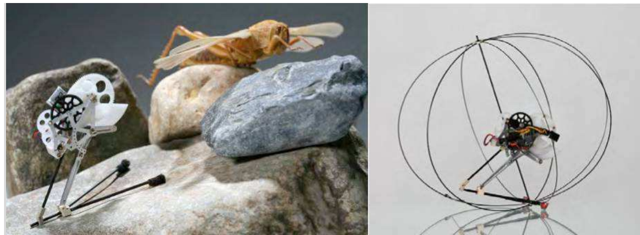
Figure. 1: Jumping robot (5cm 7grams) that is able to jump up to 1.4m in height using the same design principles as jumping insects.