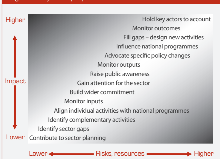
Figure 1 - Dynamic purposes of WASH Coalitions

The purpose may be straightforward or more ambitious. An example of the former might be building a coalition for the purpose of information exchange, to fill knowledge gaps and to facilitate participation in sector planning. These activities are relatively low risk; participation in such a forum carries neither high