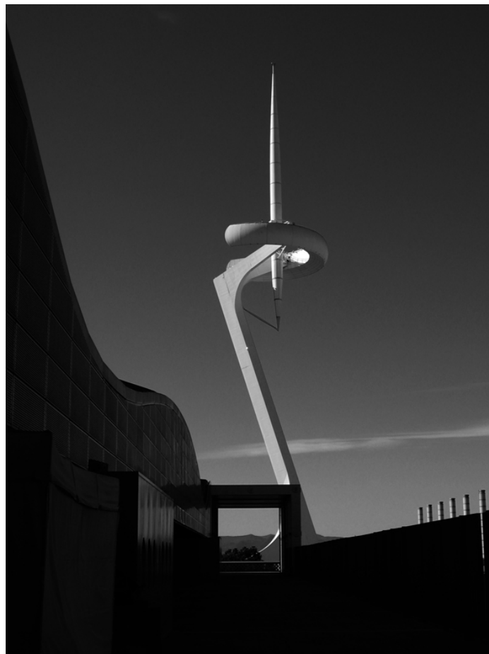
Fig. 8 The Communication Tower, Barcelona 1992

Despite the number and calibre of the invited international designers (A. Isozaki, V. Gregotti, N. Foster) the Barcelona Games were intrinsically Catalan; not only for the idea expressed above, i.e. to 'use' the Olympiads for the benefit of the City (and not the other way around) but also for the presence of a building that became the symbol of Barcelona 1992. The Communication tower in the Olympic Area of Montjuïc, by Santiago Calatrava, linked perfectly the contemporary Architecture of Barcelona to some of the most important figurative research expressed in the past in the same city, from Gaudí to Dalí. In this respect a result very similar to that which was achieved in the other Games treated in this article, Rome, Tokyo and Munich.