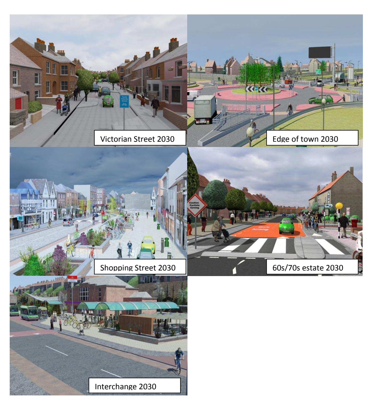
Figure 3: Five urban locations as they might appear in Vision 1 in 2030.