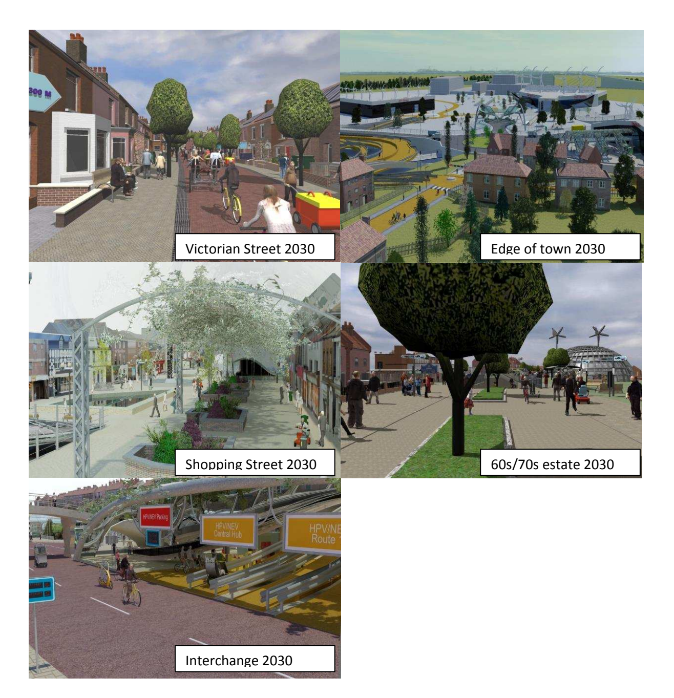
Figure 5: Five urban locations as they might appear in Vision 3 in 2030.