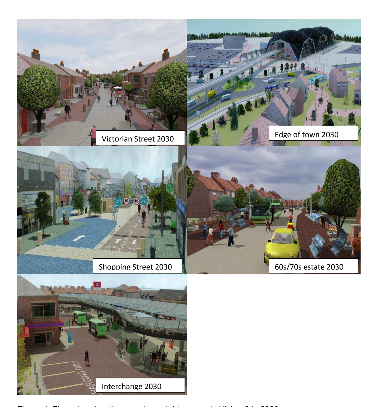
Figure 4: Five urban locations as they might appear in Vision 2 in 2030.