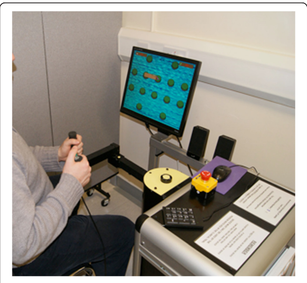
Figure 2 A left-hand device being used.

The computer program includes a base "software platform" for underlying functions and a set of activitybased tasks that was used to direct and control the exercises. The software also measures the number of hits in the assessment exercise. The assistance levels will adjust according to the performance in the assessment exercise. As the user performance increases, the assistance levels decrease by the set algorithm of the software. The computer screen provides visual and auditory feedback of the target location and the movement of the joystick. The baseline clinical examination and computer assessment exercise allows the initial exercise parameters (duration, nature of games, game levels and assistance level) to be set.