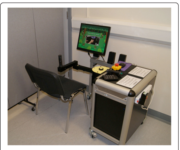
Figure 1 hCAAR device.

The interface device has a system of motors and pulleys that provide assistance to the motion of the joystick handle. The mechanism is driven by motors rated to 170mNm of continuous torque, which delivers a continuous torque after gearing of 14.2 Nm at the joystick's shoulder and 16.41 Nm at the joystick's elbow. This can produce a maximal excursion of forward flexion and extension of 70° at the shoulder and 320° of flexion and extension at the elbow of the joystick. Encoders on the motors allow tracking of the joystick handle position. This creates a position control loop, which can be changed in real time to make the handle move to different