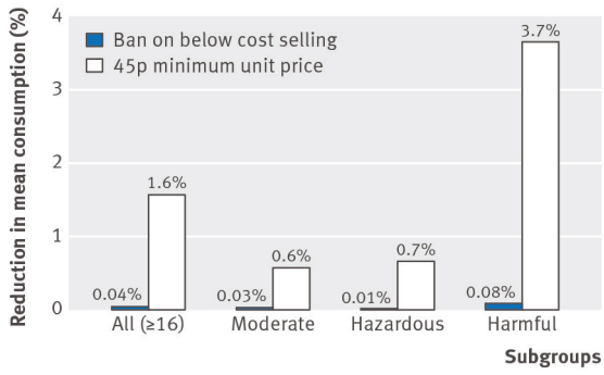
Fig 2 Modelled impact of a ban on below cost selling compared with impact of a 45p minimum unit price