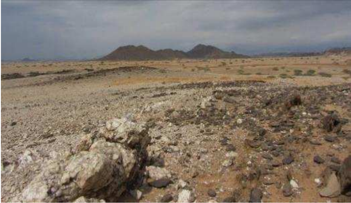
Figure 14. View from WP056 looking N towards WP057 and 055, visible as dark linear features on the otherwise relatively flat landscape. Photo by Robyn Inglis, 29 November 2012.