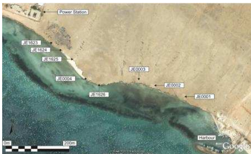
Figure 11. Google Earth image showing the location of the Janaba 4 shell mound and the other shell mounds in the vicinity, from which samples were collected. Map prepared by Matthew Meredith-Williams.