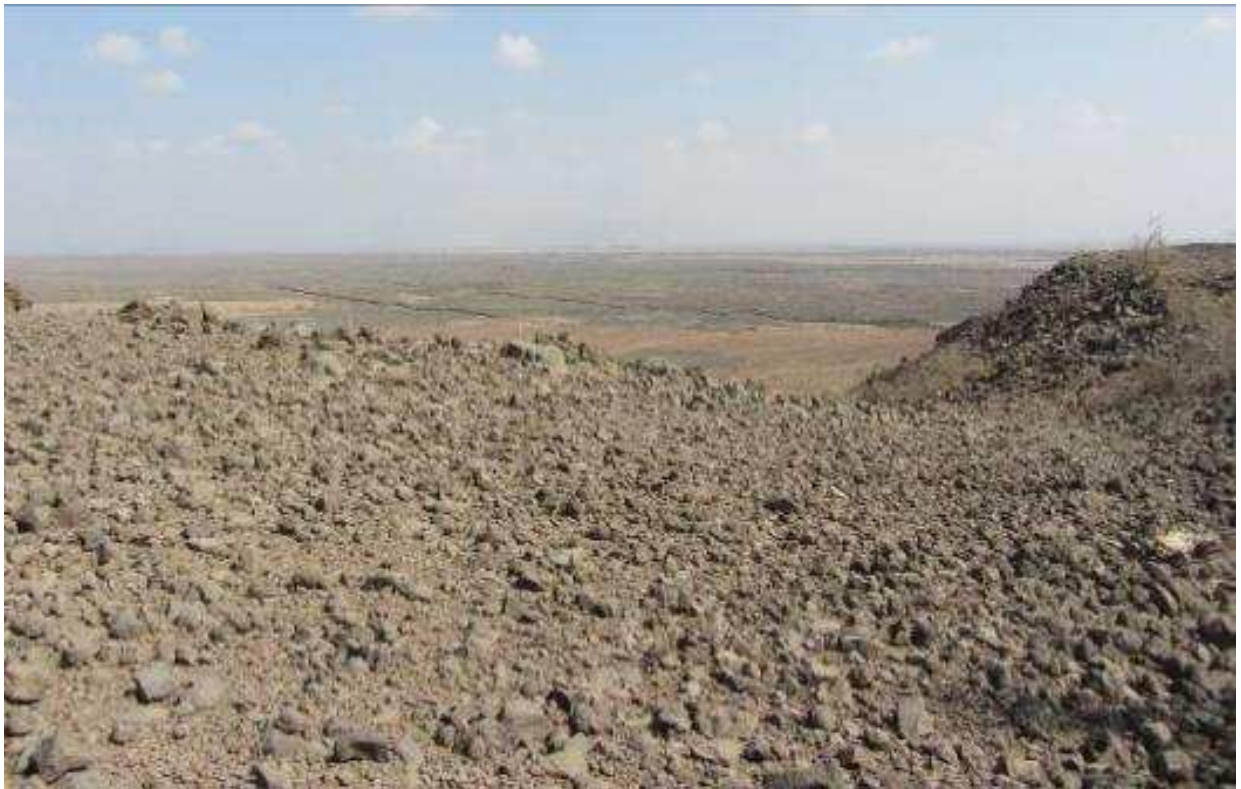
Figure 12. WP041, looking NE - lithics were concentrated in an area of particularly fine-grained basalt boulders and cobbles on the flat surface of the jebel in the foreground. Photo by Robyn Inglis, 27 November 2012.

The lava flows in the north of the Jizan region, near Al Birk and As Shugayig, contain sites previously identified by the Comprehensive Archaeological Survey Program, mainly along the edges of the lava flows. The survey of this area identified Palaeolithic artefacts at a number of sites in the area in different settings (Figure 1). These include the following: