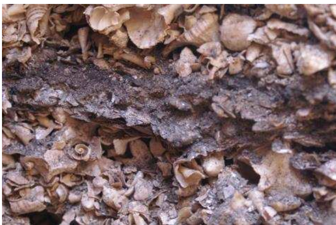
Figure 6. Close-up of west-facing section of Janaba 4 in 11G, showing layers of clean shell separated by a dark ash-dominated layer. Photo by Geoff Bailey, 18 November, 2012.

For the column sampling, we selected two columns in the west-facing section, representing the deepest parts of the mound with the most complete and representative sequence of layers: 11G