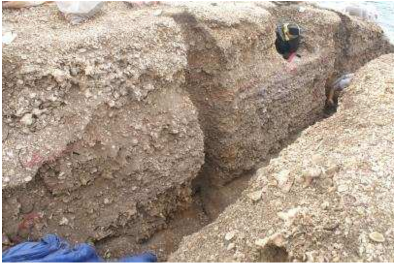
Figure 9. General view of west-facing section of Janaba 4 after removal of column samples, looking towards the South. Note the layer dominated by large gastropods ( Pleuroploca sp., Chicoreus sp.) at the top left of the section and thickening towards the left of the image. Photo by Geoff Bailey, 21 November 2012.