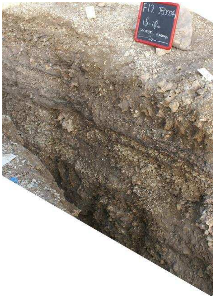
Figure 4. Part of the west facing section of Janaba 4, after excavation of the central section of the trench down to the bedrock. The horizontal banding of layers with clean Strombus fasciatus shell alternating with dark ashy layers is clearly visible in mid-section. At the top right of the section, there is a layer dominated by large gastropods of Pleuroploca sp. and Chicoreus sp., with an earthy matrix. This layer rests unconformably on the horizontal layers of small shells and ash, and lenses out towards the left of the image. The sign board is 30cm wide (excluding frame). 14 November 2012.

The sections clearly demonstrate the varied nature of the deposits in the mound and the nature of their accumulation and stratification. In the central part of the mound the deposits show a near-horizontal banding with thick layers of shell dominated by the small gastropod, Strombus fasciatus , alternating with thinner ash-rich layers, often rich in fish bone, which show up as black bands in the section (Figure 6). Higher up in the section, it is clear that the deposits