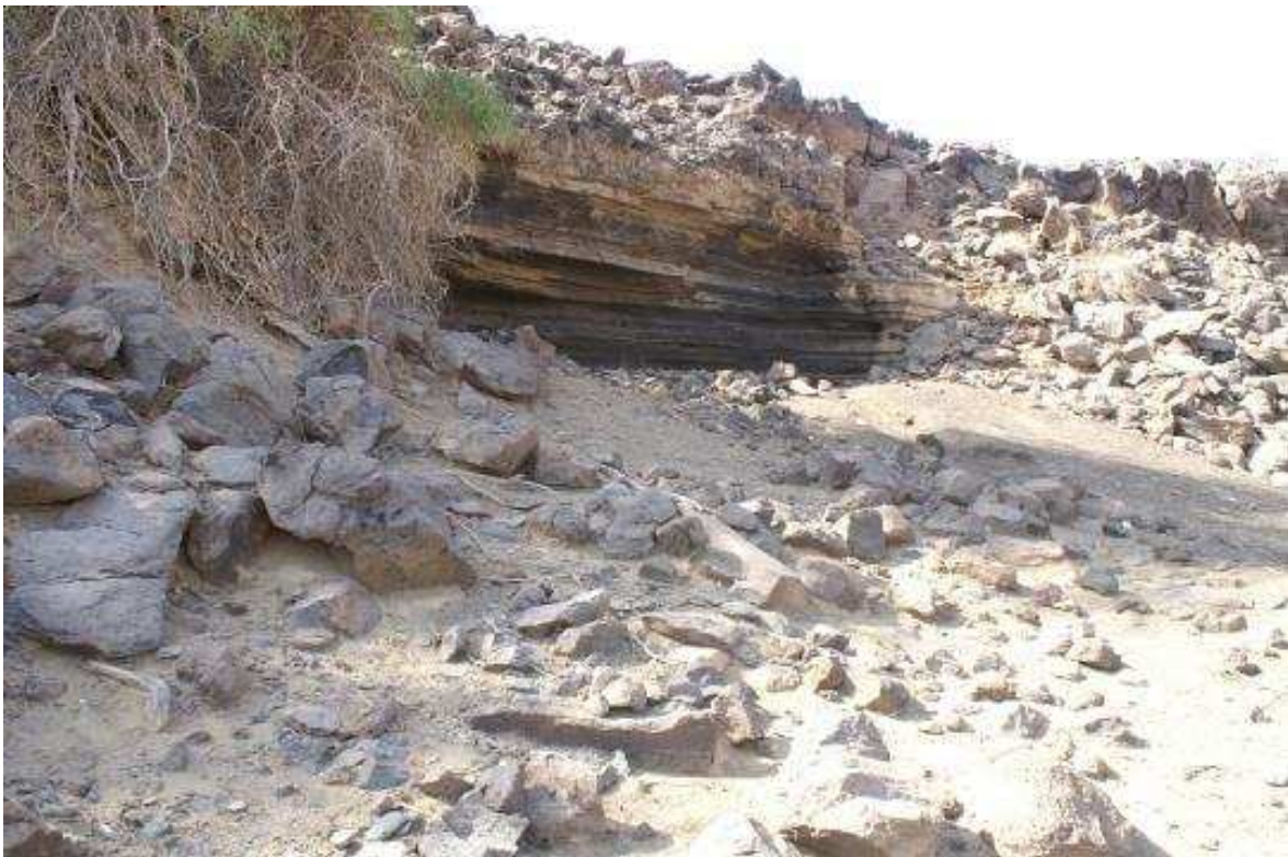
Figure 15. Rockshelter formed in a sandstone cliff capped by a lava flow on the edge of a wadi near As Shugaig at Waypoint 049. Photo by Geoff Bailey, 27 November 2012.