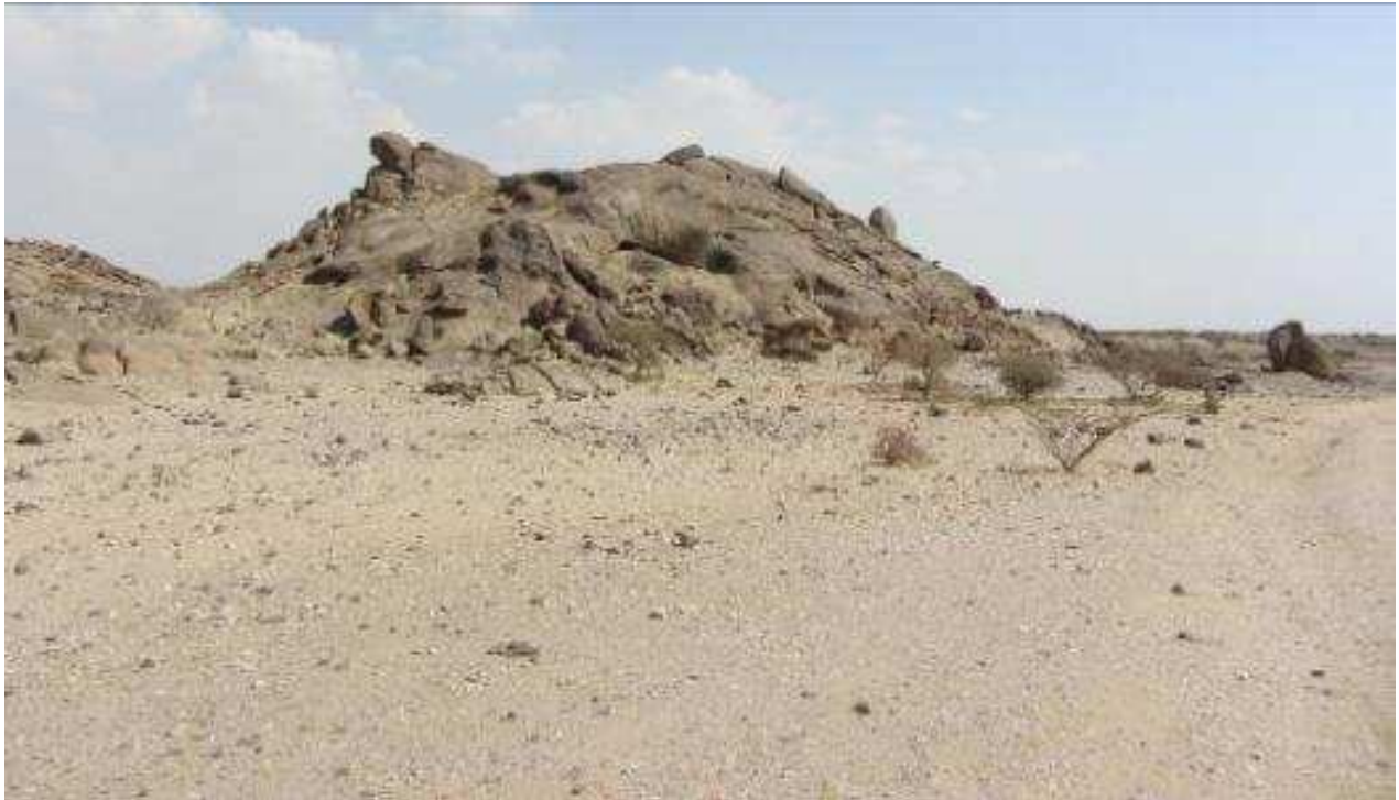
Figure 13. WP045 - the easternmost end of the linear granite outcrop, looking NE. Lithics of multiple types and raw materials were found across the surface around the base of the outcrop. Photo by Robyn Inglis, 27 November 2012.

WP045. Multi-period lithics on a range of raw materials including basalt, chert, and granite, and potentially quartz were found around the base of a linear granite jebel of basalt (Figure 13). This is located to the east of the Hajambar/Muhayil road in an otherwise flat landscape dominated by deflated surfaces dominated by quartz but including other raw material.