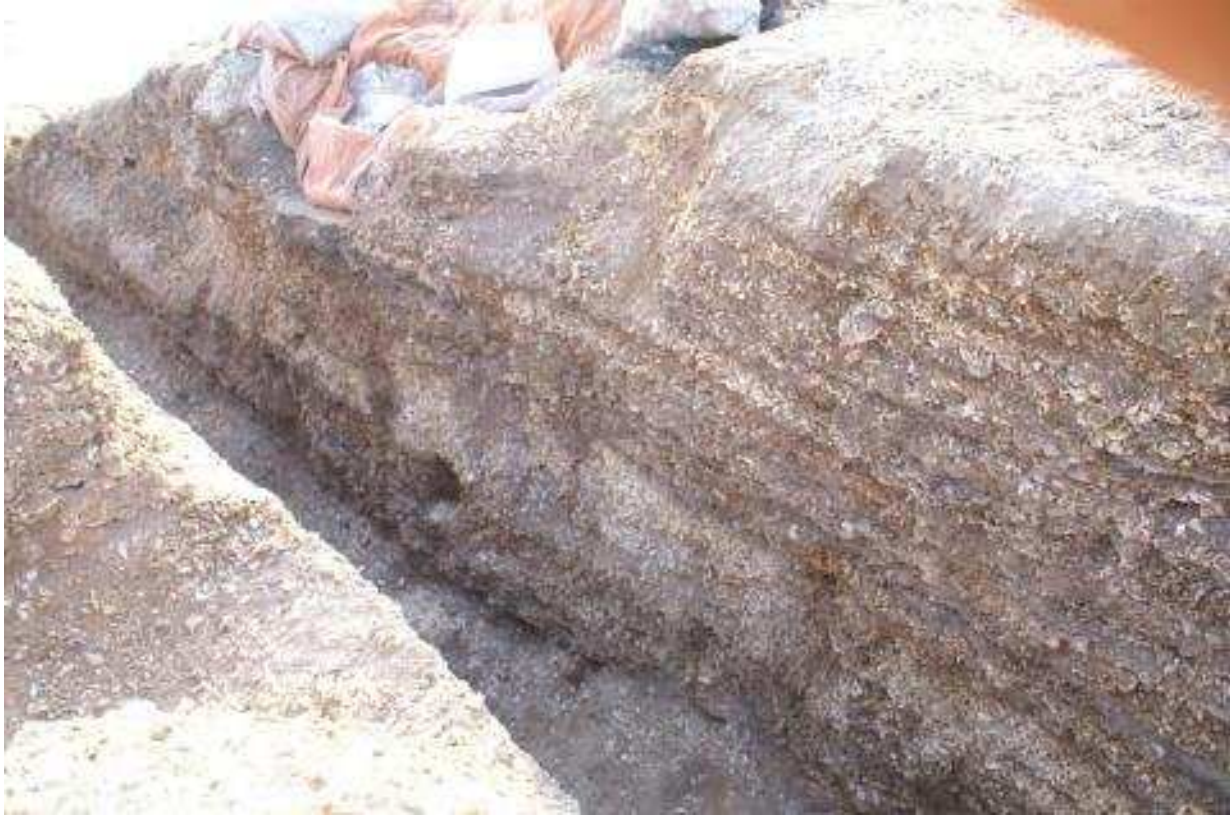
Figure 5. General view of the east facing section of Janaba 4, looking towards the South. The horizontal banding of Strombus -rich layers and ash lenses is clearly visible. Photo by Geoff Bailey, 14 November 2012.

have become truncated by slumping or removal of deposits on the slope of the accumulating mounds, particularly near its edge, with overlying accumulations of shells, often dominated by the larger gastropods, such as Pleuroploca pleuroploca and Chicoreus trapezium .