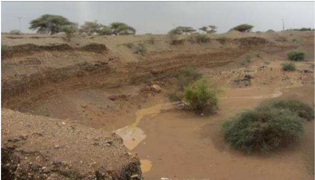
Figure 16. Quarry at WP304, 8km N of Hajambar. Note in-situ lava to the centre right of the photos, as well as the extensive horizontally-laminated potential lake sediments at the base of the quarry cut which were sampled for palaeoenvironmental analysis and dating. Photo by Robyn Inglis, 29 November 2012.

This quarry was located in the May–June 2012 survey c. 8km North of Hajambar on the Hajambar/Muhayil road, and contains a series of stratified deposits, the lowermost of which were initially interpreted as lake sediments (Figure 16). On this occasion, we sampled these lower sediments for additional analysis. Three dating samples were removed from the section for OSL dating, as well as a column of 68 small bulk sediment samples for sedimentological analyses, along with 13 intact blocks for analysis by soil micromorphology. A mixture of stone tool types and materials, predominantly quartzite were recovered from various unstratified locations within the quarry, although two quartzite flakes were removed from the most recent unit of wadi deposits at the north end of the quarry.