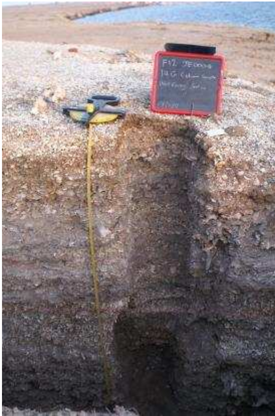
Figure 7. West facing section of Janaba 4, after removal of the column samples from 14G. The sign board is 30cm wide (excluding frame). Photo by Geoff Bailey, 17 November, 2012.

near the thickest part of the mound at its centre; and 14G, which samples a wider range of shell layers with differing characteristics nearer the north end of the section (Figures 7, 8 and 9).